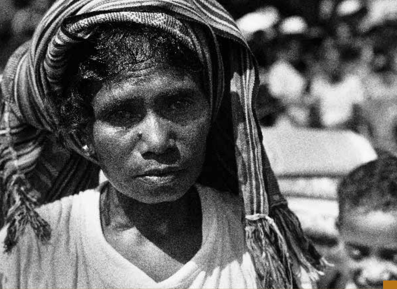
A refugee woman in Timor-Leste ready to return home.

police officers (including the anti-riot force) were trained in basic human rights and community policing.