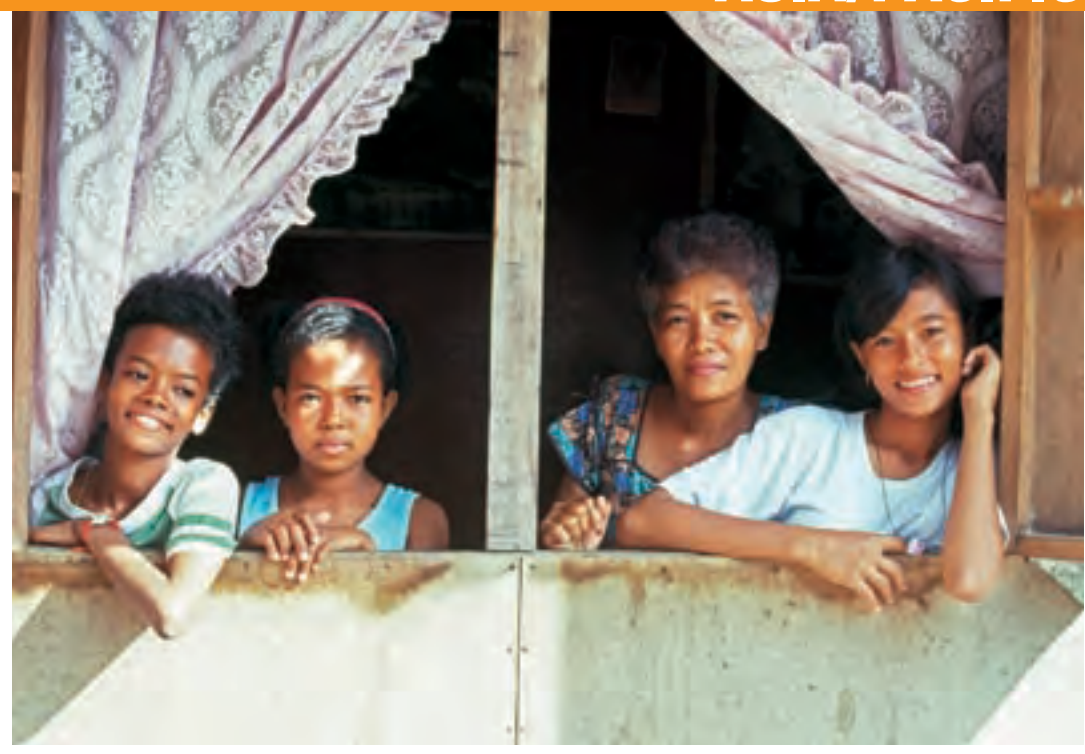
▲ Window of opportunity: The 2009 Magna Carta of Women in the Philippines mandates the State to change discriminatory laws.

In 2009, UNIFEM also supported legislative changes across Asia, including a new law for domestic violence prevention in Nepal, which includes a budget provision for services. The Domestic Violence Control and Punishment Act recognizes physical, mental and economic violence as well as sexual harassment. It facilitates medical treatment for survivors along with compensation, shelter arrangements and protection of the survivors' children