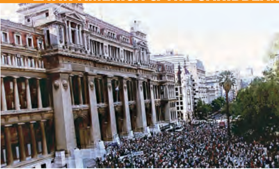
▲ Rallying to end violence: The Office of Domestic Violence in Argentina's Supreme Court assists women survivors and tracks the judiciary's response to cases of gender-based violence.

Also in 2009, in Argentina, UNIFEM, along with UNDP and UNICEF, supported the establishment of the Office of Domestic Violence of the Supreme Court, which is