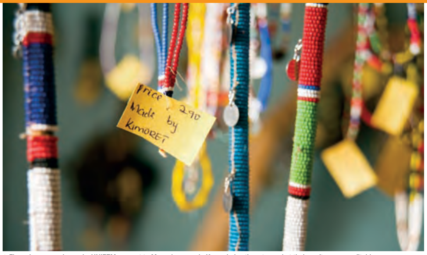
▲ Financing women's needs: UNIFEM support to Maasai women in Kenya helps them to market their crafts more profitably.