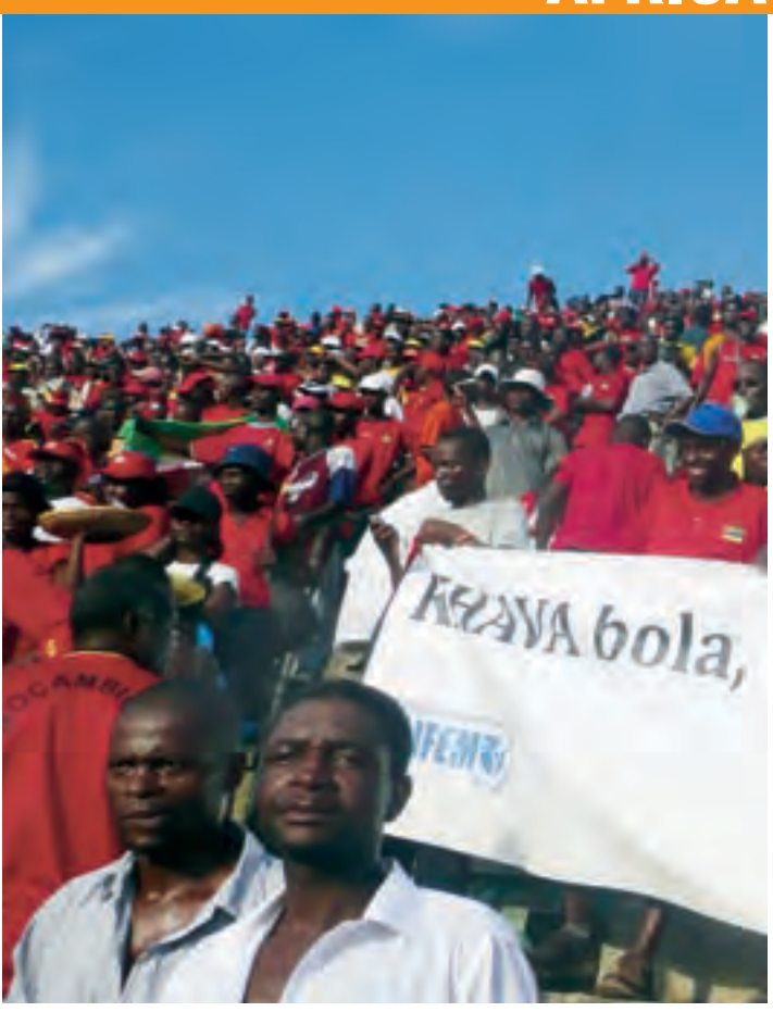
▲ Standing up to end violence against women: Men in Machava Soccer Stadium in Mozambique show support with signs reading 'Kick the ball, not the women'.

advocacy meeting was organized by the Network of Religious Leaders in West Africa, supported by UNIFEM. In the lead-up to the 2009 communal elections, the gathering sent a clear message that