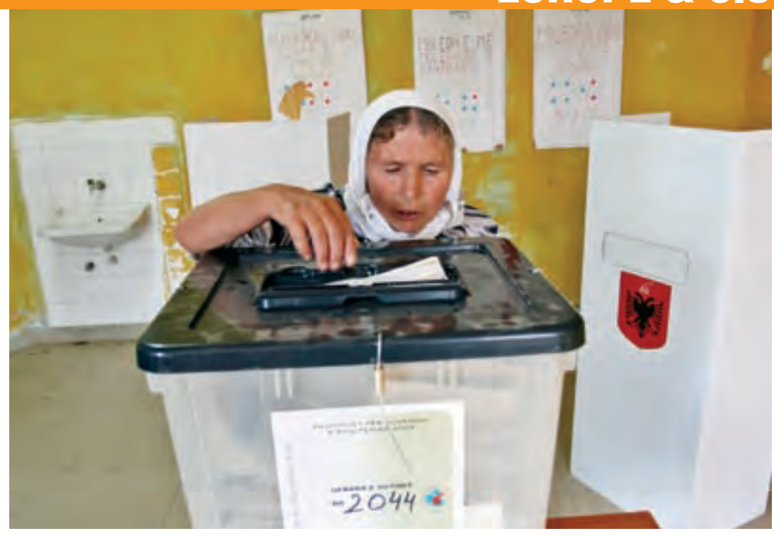
▲'I vote, I am represented' was the mantra that resonated across Albania for the 2009 elections, which more than doubled the number of women in Parliament.

Since the late-1990s, UNIFEM has worked across Central and Eastern Europe and the Commonwealth of Independent States (CIS) to ensure that women's needs are on national agendas. In Kazakhstan, a major victory was achieved with the adoption of the 2009 Domestic Violence Law, the only legislation in the CIS region to ensure protection