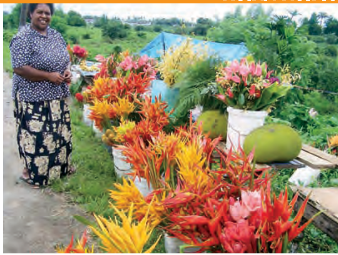
▲ Promoting women's leadership: An analysis of the working conditions in the bustling markets of Melanesia has encouraged women vendors to demand change.

In Jordan, a destination country for many Asian women migrants, legal domestic workers will now get 14 days of paid and additional sick leave. Following years of joint advocacy by UNIFEM, the National Centre for Human Rights and partners, two Migrant Workers Labour Bylaws were adopted in 2009. They ensure basic rights, such as food, a room with light, and a free phone call to families once a month. Recruiting agencies are also mandated to take bank insurance as financial compensation in case of non-compliance with the Bylaws.