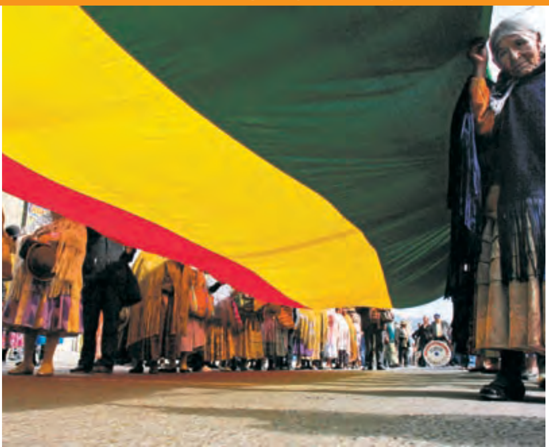
▲ Pathway to reform: In Bolivia, women's organizations are advocating to adopt the Women's Legislative Agenda, which calls for a series of progressive laws.

In 2009, UNIFEM worked across the Latin American region to increase women's economic security and advance gender equality. In Bolivia, efforts are underway to quantify household work undertaken by women and have it reflected as an asset to the National Budget. The proposal is part of the Women's Legislative Agenda, a series of bills to