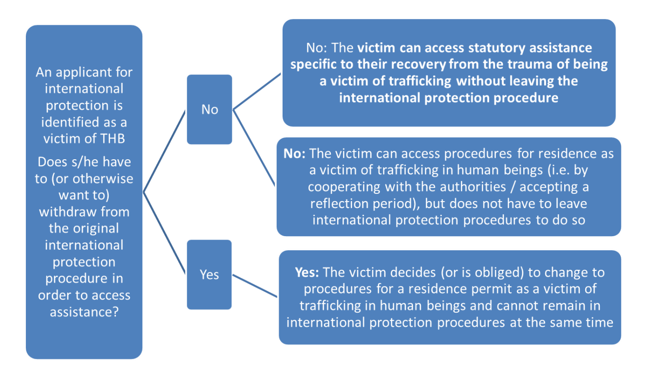
Figure 8.1: flow chart illustrating the possibilities for referral to assistance for victims in international protection procedures