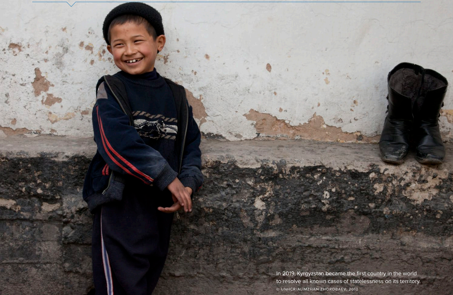
In 2019, Kyrgyzstan became the first country in the world to resolve all known cases of statelessness on its territory.