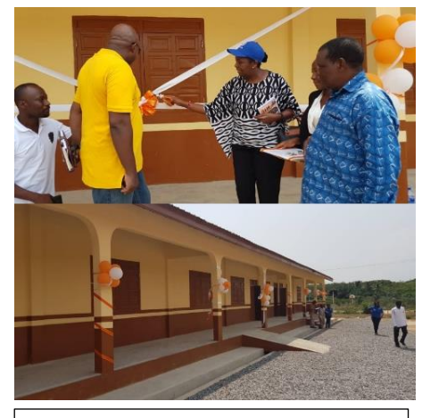
UNHCR Rep cutting the tape for the opening of a 3-unit classroom block in Egyeikrom Camp