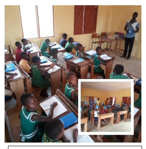
Children in Fetentaa Camp School with the eReaders