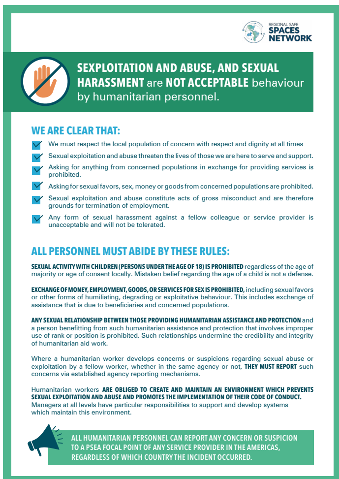
Poster for personnel and service providers