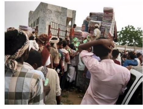
A total of 729 families in Alluheyah district—one of two floodaffected districts in Hudaydah governorate—received basic household items. This year, UNHCR through partner Jeel Al Bena distributed basic household items to some 98,000 IDPs and vulnerable host community members.

UNHCR, through partner Jeel Al-Bena, has completed the distribution of basic household items and emergency shelter kits to 1,824 IDP families affected by recent flooding in two northern districts of Hudaydah. An additional 2,800 IDP families were identified as needing basic household items and emergency shelter in the neighbouring Al Munirah district of Hudaydah governorate and Abs, Hajjah governorate. The list is currently under verification to avoid duplication or fraud, and will soon be shared with UNHCR for the next distribution.