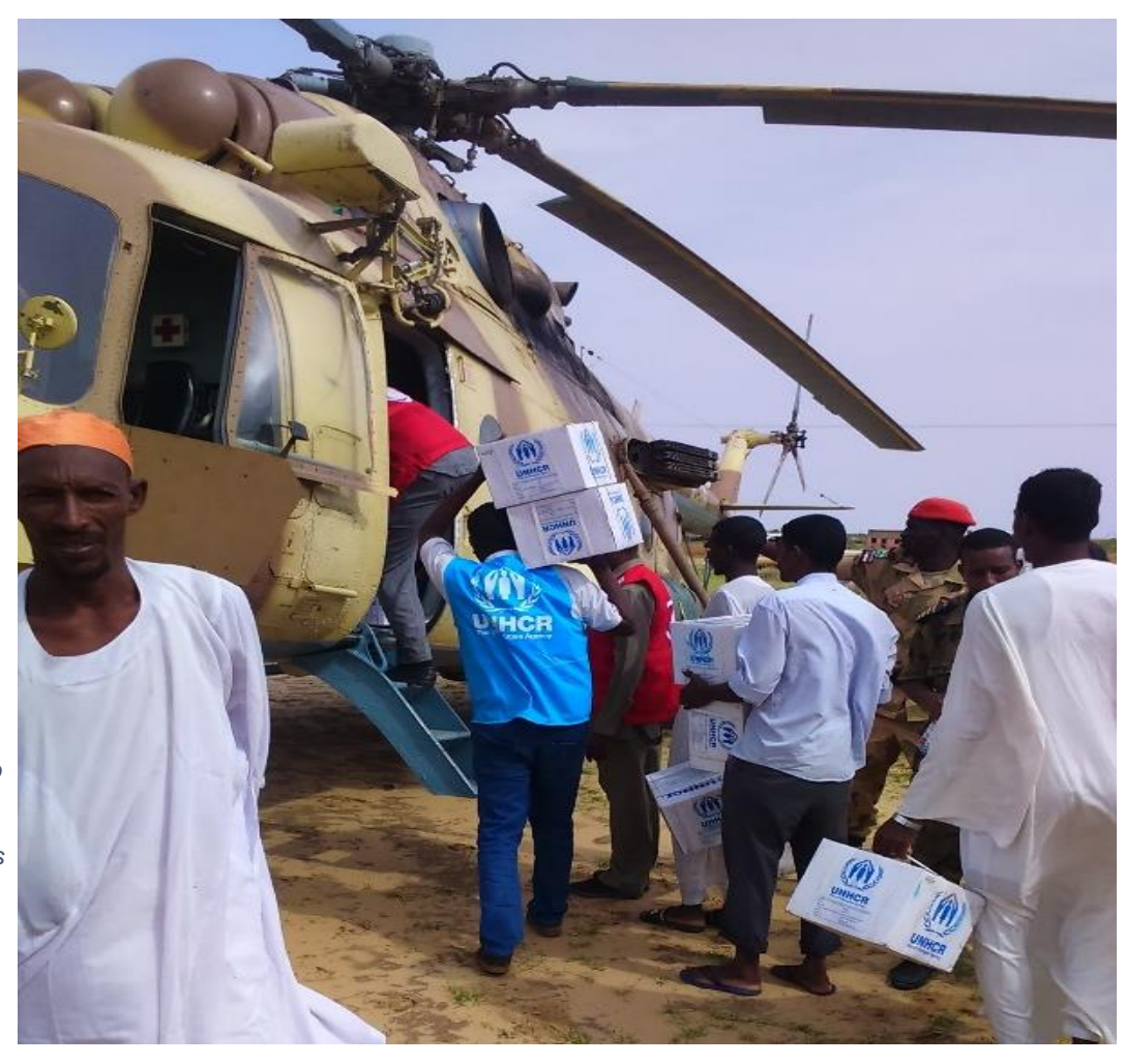
UNHCR and SRCS delivered 544 NFI sets to Jouri and Al-Kashafa host community villages in White Nile State. Items were delivered by helicopter due to road inaccessibility.

UNHCR, the Sudanese Red Crescent Society (SRCS) and other partner NGOs are currently continuing the flood response in White Nile State, South/North/West Darfur, in addition to planned responses in North Kordofan. Moreover, UNHCR is working with partners to update figures on existing NFI stocks in Sudan and to coordinate replenishments as needed. As the total numbers of impacted individuals and destroyed homes are likely to increase with continuing reports from affected areas, UNHCR and partners will work on advocating for adequate funding and sufficient NFI/ES stockpiles to deliver an appropriate response.