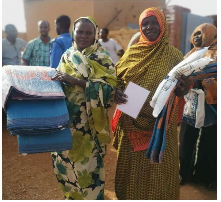
Refugees and host community receiving NFI/ES assistance in Khartoum's 'Open Areas', August 2019

The distributions in the open areas involved the piloting of the Global Distribution Tool (GDT), which utilizes biometric registration data in the proGres V.4 database to verify beneficiaries and household members). The GDT allowed the distributions to occur faster and in a more organized manner, which played was critical in getting the assistance before the floods began in force across the country. The total cost of the "open area" distributions were approximately USD 750,000. UNHCR and COR plan to provide NFI support based on assessed needs in other neighbourhoods in Khartoum where South Sudanese refugees and the local community have been affected by recent flooding.