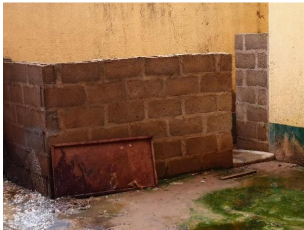
Female toilet camp Faskari LGA in Katsina State.

The WASH facilities in most camps across the 3 states are appalling. In Faskari LGA, Katsina,