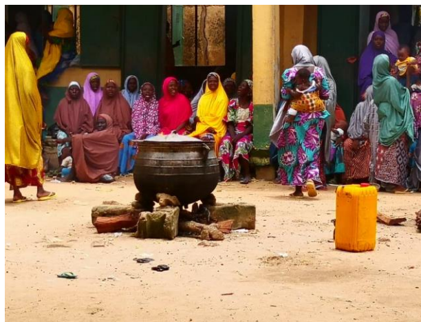
Communal cooking in an IDP camp in Katsina State.

In Sokoto and Zamfara states, dry rations of food are provided in the camps by the state and local government, with little or no condiments or utensils for cooking.