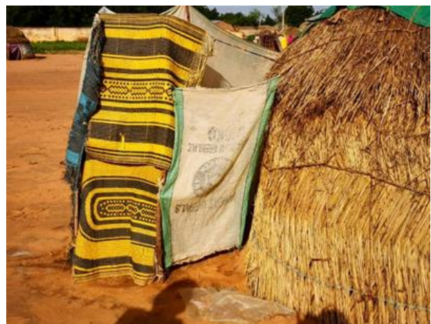
Makeshift toilet for Men in IDP camp in Rabah LGA, Sokoto State.

reported by health workers in the camp that the water was contaminated and unsafe for consumption. The local government representatives disclosed that there is a bore hole and water pump in the camp, which needs repairs. In camps in Katsina, Sokoto and Zamfara states, the team observed water pumps, where the IDPs queue to get water. Also, in Katsina state, water trucks are stationed in the camps to supply water to the IDPs. There is a significant need for sanitation materials and delivery kits for the women, according to health workers in the camps.