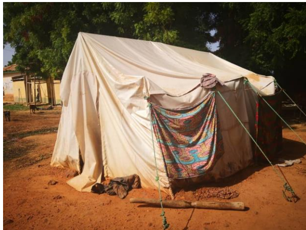
Makeshift tent in IDP camp in Rabah LGA, Sokoto State.

In the states visited, the IDPs are provided with temporary accommodations, mainly in the local primary and secondary schools and in host communities with relatives. The living arrangements in the schools are according to gender as opposed to family units. The women and children occupy most of the classrooms. This is because there are more women and children in the camps than men, many of whose husbands/fathers are not present. Across the states, the rooms lack sufficient beddings, only a few have mats, most sleep on bare floors and the men live in tents or classrooms in close proximity to the women. In