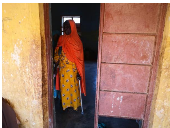
Physically challenged elderly woman in an IDP camp in Zamfara State.

The team identified elderly male and female heads of households. They reported that as a result of the crisis, they had lost their children and have become primary caregivers of their grandchildren. They lamented that they find it difficult to feed and cater for them. The team also identified elderlies that are physically challenged, some are without support, and depend on the goodwill of other IDPs.