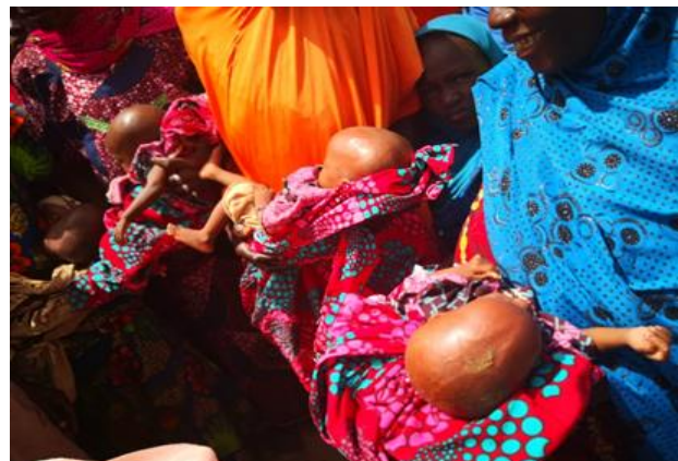
8 Months old triplet suffering from acute Malnutrition in Goronyo LGA, Sokoto state

In Sokoto and Zamfara states, there is limited