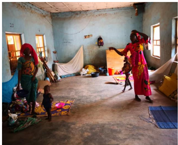
Shelter for women and children in an IDP camp in Zamfara State.

In Goronyo LGA, Sokoto state, the women and girls walk 3-4kilometers along bush paths to get water and firewood. This presents serious protection risks that could result in sexual violence, if prevention measures are not effected. There are a significant number of female headed households in the IDP camps and host communities, across the states. The women whose husbands were either killed, kidnapped or cannot be located, often have to fend for large families, with little or no means of income. Some IDP women living in host communities in Isa and Sabon Birni LGAs, Sokoto state, reported that they have to take up any available jobs in the struggle to feed their families. IDP women in camps and host communities, repudiated the notion of survival sex, when asked, stating that their village heads will not deal kindly with such practices. In some camps, the women have little or no privacy. They sleep in rooms