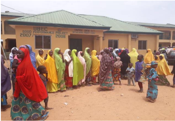
New arrivals being registered in an IDP camp in Katsina state.

The local government representatives and SEMA in the states informed that the IDPs are registered according to households. They also register new births and new arrivals. In Batsari LGA, Katsina state, the team observed new arrivals being registered by local government officials.