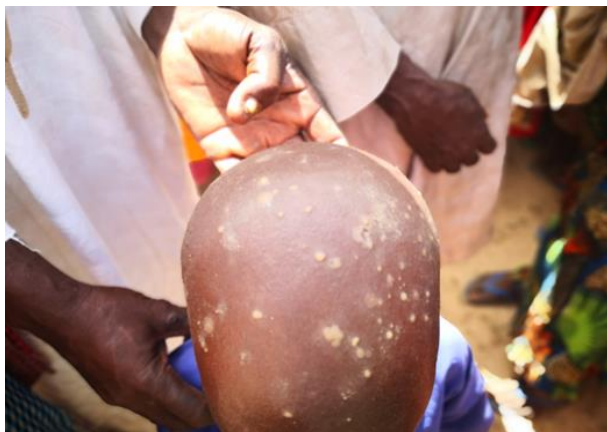
Child with skin infection in Goronyo LGA, Sokoto State.

access to primary healthcare. The clinics lack sufficient drugs and professional health workers. The local government representatives informed that NCFRMI and UNICEF have been instrumental in setting up the clinics and provided some drugs and medication, but they are fast running out of supplies. In Anka LGA, Zamfara state, MSF was on ground, providing medical assistance.