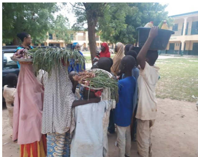
Children hawking wares in the IDP camp in Faskari LGA, Katsina State.

Across the states, the team observed younger IDP children with bowls, begging, and older children, especially girls, hawking wares within and outside the camps.