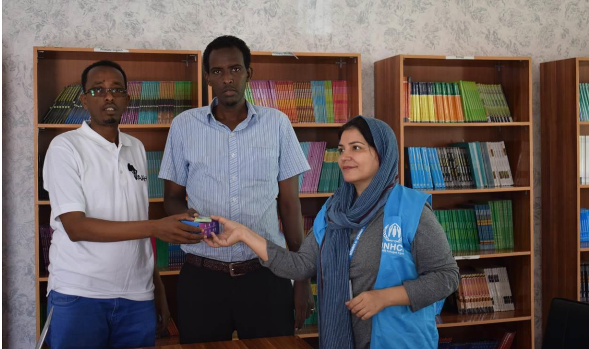
UNHCR distributed a mobile phone to a Yemeni refugees for providing subsistence allowances.