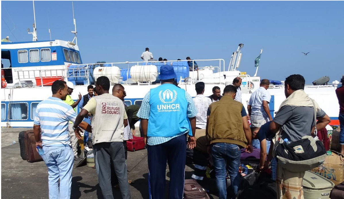
UNHCR receiving new arrivals from Yemen before proceeding to the Reception Centre in Berbera.