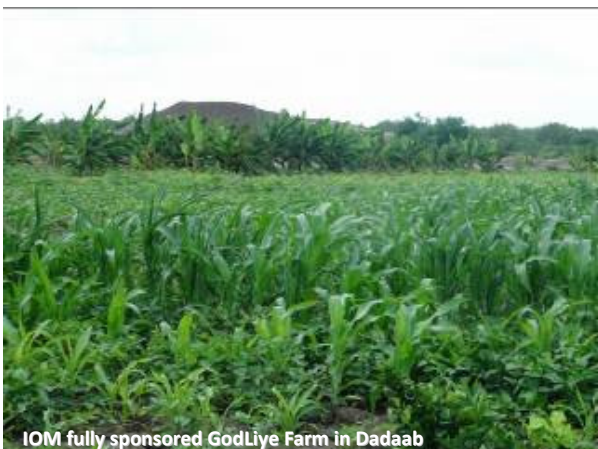
IOM fully sponsored GodLiye Farm in Dadaab