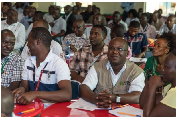
Newly arrived refugees are briefed by a UNHCR staff at Nadapal Transit centre before being facilitated to Kakuma Camp. Over 75% of registered newly arrived refugees are from South Sudan.