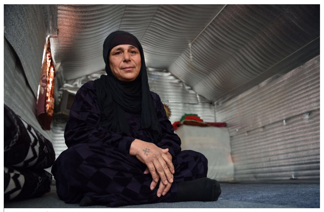
A 47-year-old Syrian woman sits in her caravan in Azraq camp in Jordan, which has benefitted from insulation for the winter. December 2017

Syria Regional Refugee Response portal; UNHCR website