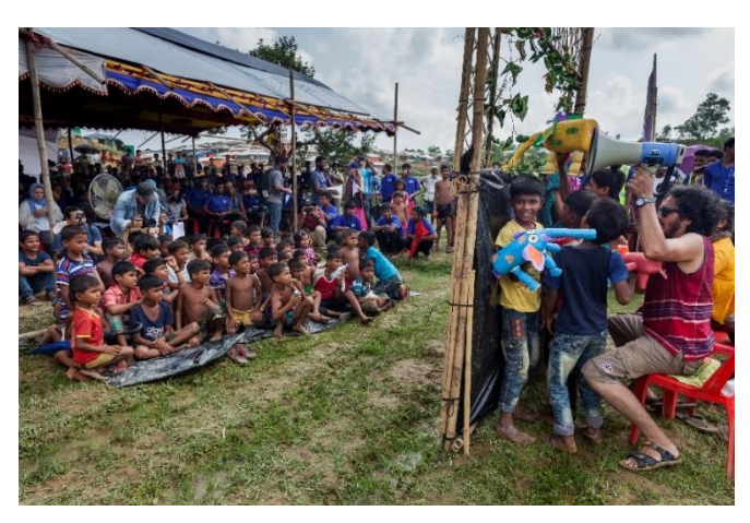
Refugee children and adolescents, with the help of IUCN, perform a puppet show on the occasion of World Refugee Day to raise awareness about elephant-human incidents.

In Cox's Bazar, UNHCR in collaboration with partners and local artists held a cultural event at the town's Cultural Center, where the art and handicrafts of Rohingya refugees, in addition to local artists, were exhibited. Human Flow -\ a