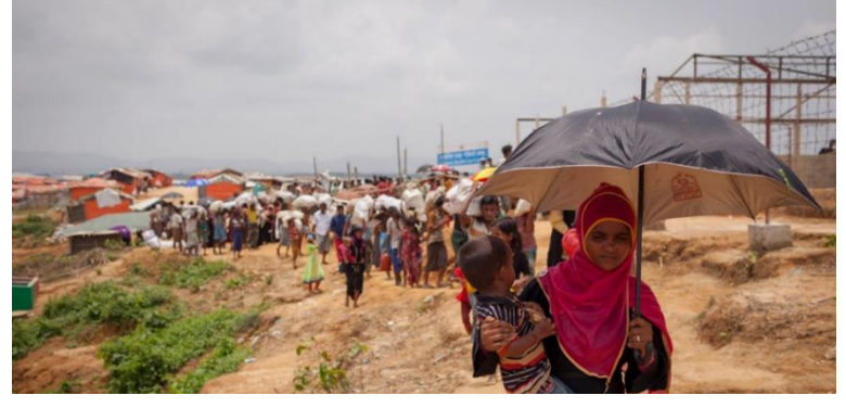
Twenty-one refugee families, who lived in areas at risk of flood and landslides, are moving to Camp 4 extension, a new settlement in Kutupalong in Ukhia sub-district.

area provided by the Bangladesh Government for monsoon response. On Monday 18 June, 21 families (87 individuals) moved to the new extension to the west of Kutupalong settlement. Relocations to other new settlements by IOM continue apace with the installation of shelters and basic facilities. UNHCR is supporting IOM's efforts with 500 tents to be used as emergency shelters for