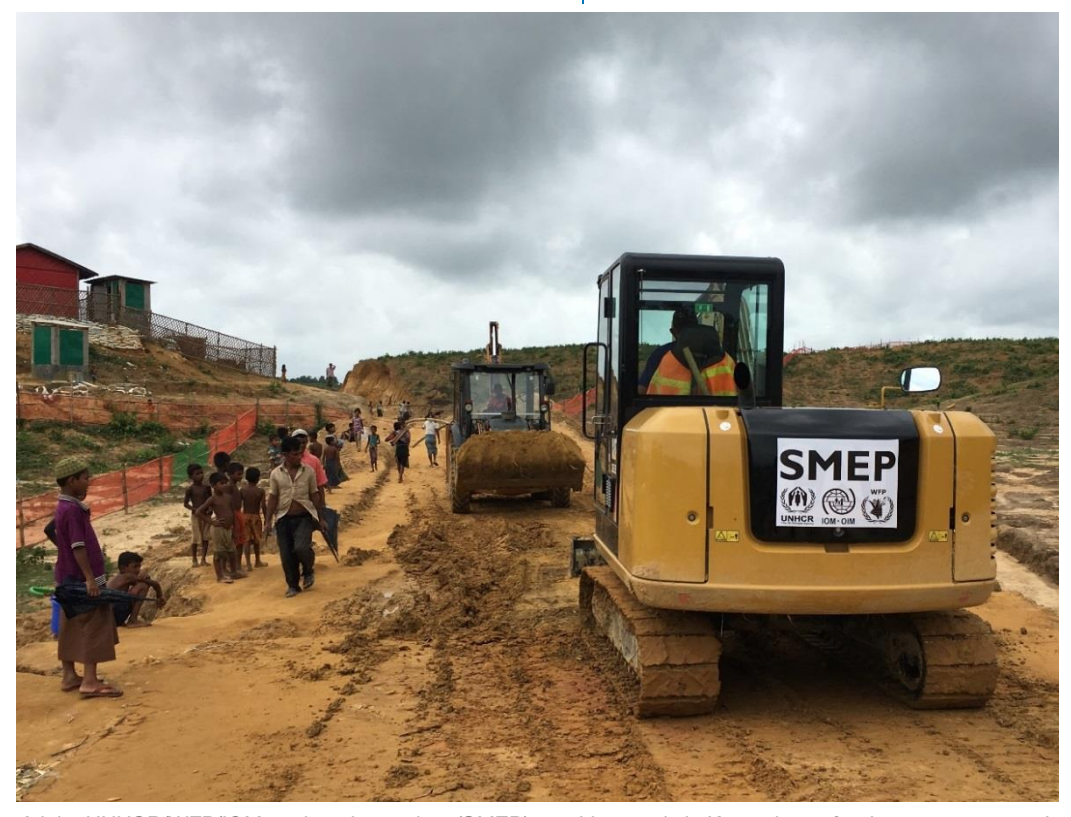
A joint UNHCR/WFP/IOM engineering project (SMEP) repairing roads in Kutupalong after heavy monsoon rains in mid-June.