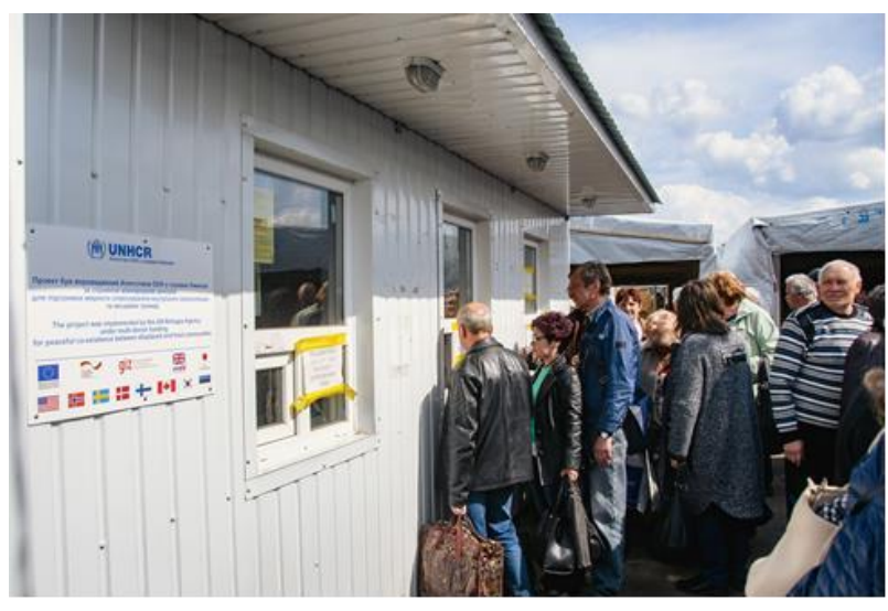
UNHCR and its donors' support to the EECPs are visible at all checkpoints, such as in Mayorsk EECP (photo). This photo shows booths of the State Border Guards as well as shades for the waiting areas provided by UNHCR.