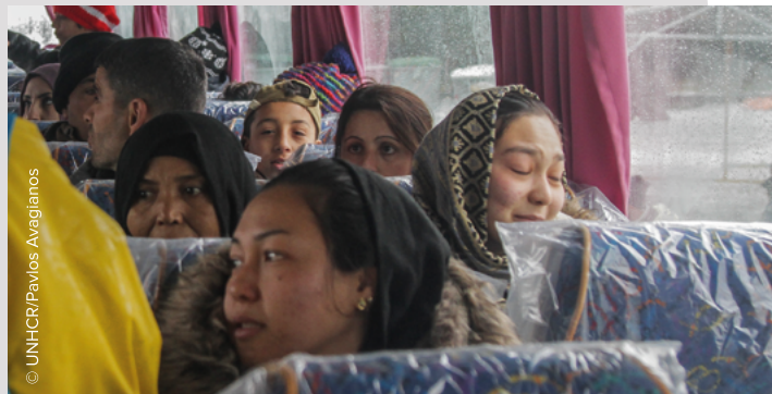
Refugees board a coach to be taken to a nearby hotel.

UNHCR is assisting people in need in Greece, as refugees and migrants continue to risk their lives in a desperate bid to reach Europe. In 2016, with the support of donors like you, UNHCR helped shelter 11,878 of the most vulnerable people in apartments. We also placed nearly 5,000 people in unused hotel accommodation and made sure they had access to food, hygiene items, basic social support, as well as medical, legal and psychosocial support.