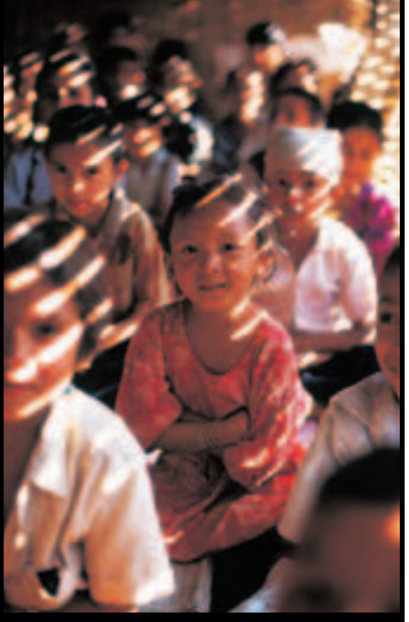
Many stateless persons are denied even basic human rights, but at least these children from Bhutan enjoy primary school while they await their fate in Nepal.

Because refugee and statelessness problems sometimes overlap and may be interdependent, UNHCR has been designated by the UN General Assembly to effectively become the overseer and guardian of the world's stateless people and the various efforts to help them.