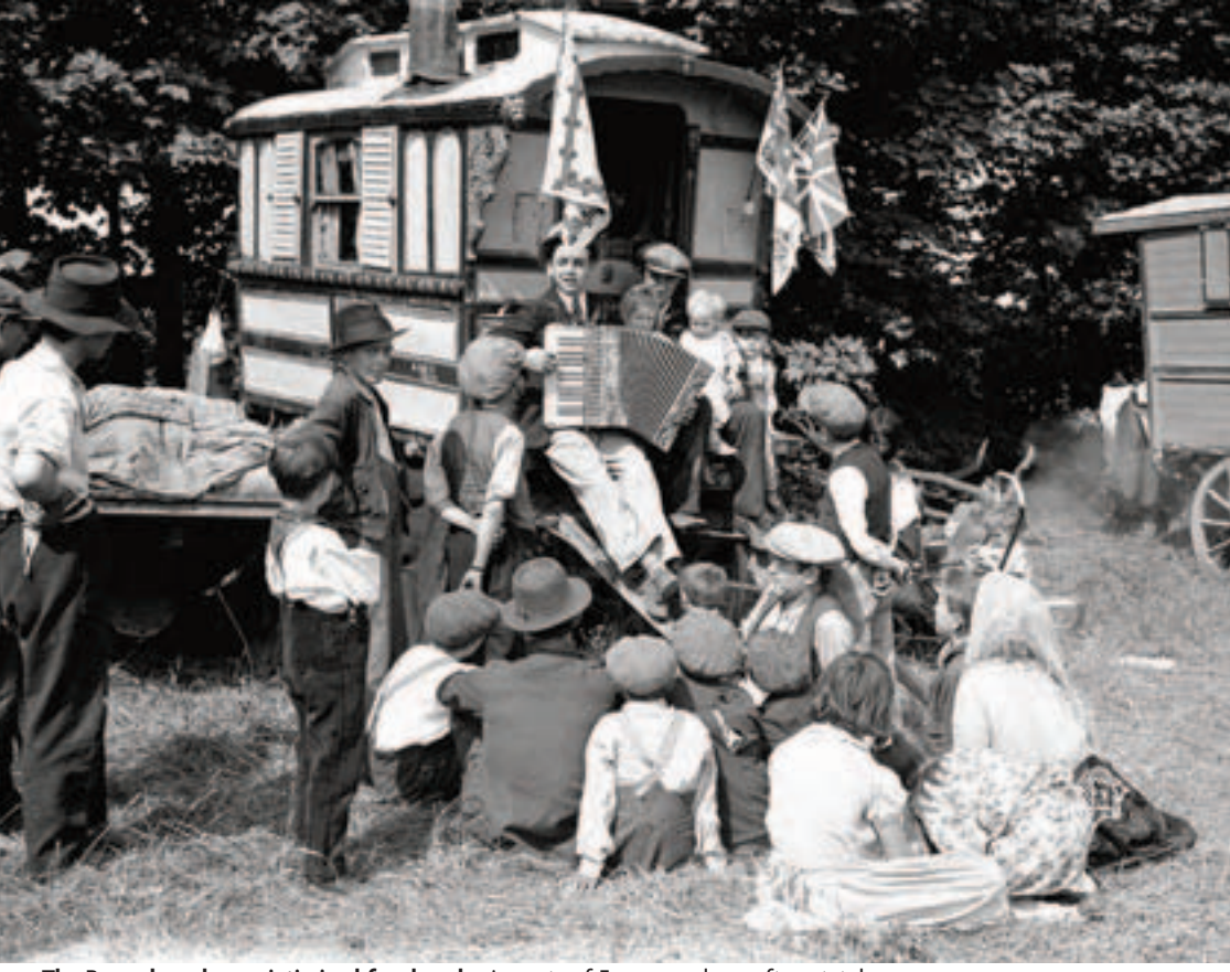
The Roma have been victimized for decades in parts of Europe and are often stateless.

ARENTS CANNOT OFFICIALLY REGISTER the birth of a newborn baby. As the child grows, he or she may not be able to attend school or university, obtain a job, travel or even get married. And when these children grow old and die, they may suffer the final indignity – an anonymous burial without any official trappings or recognition.