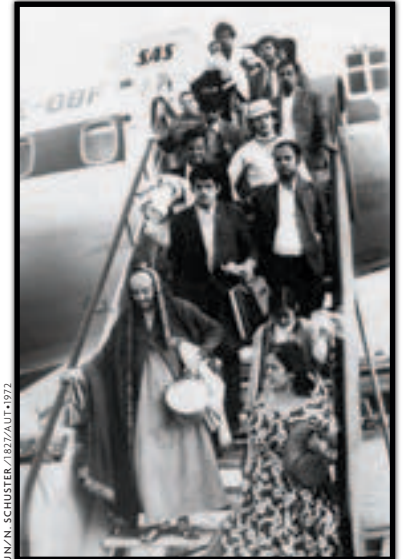
Tens of thousands of Asians were arbitrarily expelled from Uganda in the 1970s and became effectively stateless.

Though its early work was mainly in eastern and central Europe helping such groups as descendants of the Tatars who were forcibly deported from the