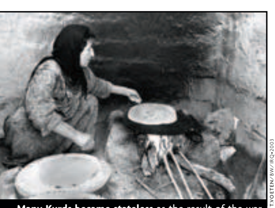
Many Kurds became stateless as the result of the war between Iran and Iraq.

* Some countries use the word 'nationality,' others 'citizenship' to denote the legal bond. In this brochure, both are used synonymously.