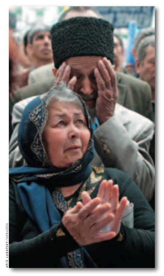
Crimean Tatars in Simferopol, Ukraine, during a 60th anniversary ceremony commemorating their mass deportation to Central Asia during World War II.