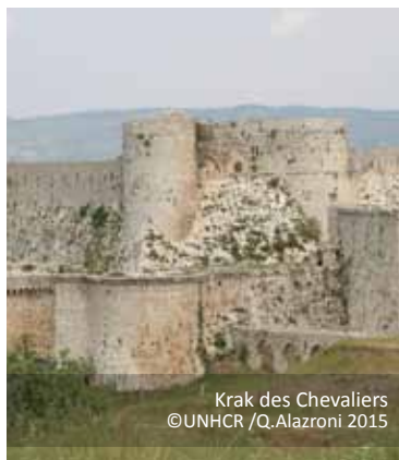
Krak des Chevaliers

On the 12 May UNHCR visited Al Hosn village in rural Homs which has been severely damaged during the past few years of conflict. The village which lies below the Krak des Chevaliers, one of the most important preserved medieval crusader castles in the world, is now the scene of families, both refugee and IDP, returning to try rebuild their lives and homes.