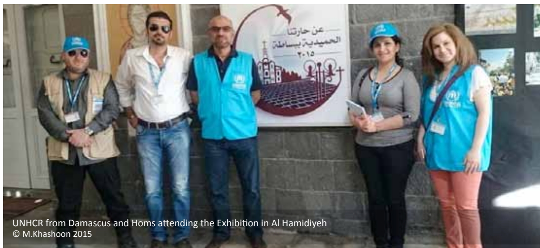
UNHCR from Damascus and Homs attending the Exhibition in Al Hamidiyeh

One year on, assisted by UNHCR and its partners this number has increased to over 2,000 people. Clean up operations, reconstruction and refurbishment can be seen throughout. There are even a number of small businesses opening up as the community works hard to rebuild their lives.