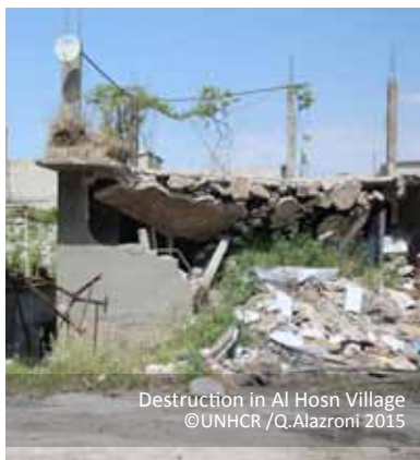
Destruction in Al Hosn Village