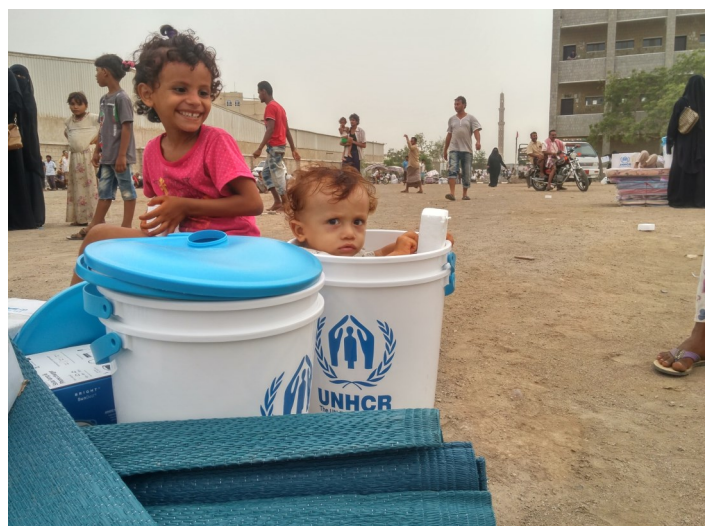
IDP children feeling happy with the NFIs provided to their family in Al Hudaydah City.