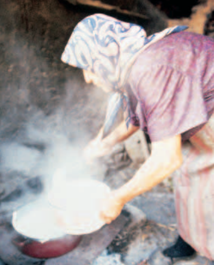
A returnee in the Skopje region.

threat of unexploded ordnance and landmines, as well as structural damage to homes still awaiting rehabilitation. In 2002, large numbers of the population still lacked freedom of movement or sufficient access to basic services including schools, health facilities, and utilities. Many lost their livelihood with the closure of small businesses, and unemployment was estimated at 32 per cent of the workforce. Ethnic and crime-related violence was rife. Communities remained divided, with views polarised on many essential issues: general elections, the census, documentation and citizenship, and legislation related to the Ohrid FA implementation. This impeded co-operation with governmental institutions on priorities such as the development of a fair and efficient asylum procedure and the adoption of an asylum law conforming to international standards. The temporary nature of the THAP status impeded the search for durable solutions, particularly local integration, and left refugees feeling anxious about the future. In July, the decision to resettle 307 persons from the Roma, Ashkali and Egyptian minorities revived demands for group resettlement from those remaining, hampering the search for other durable solutions, especially repatriation. Although security in Kosovo did improve in 2002, it remained the major factor preventing the return of minorities from FYROM.