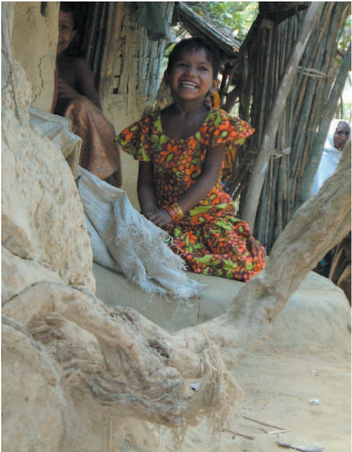
Bangladesh: Nearly 20,000 refugees in the camps rely on UNHCR for humanitarian assistance.

possibility of naturalization. There were no reported incidents of refoulement .