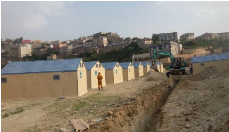
Refugee Housing Units (RHU) being installed by UNHCR through Jeel Albena Association for Humanitarian and Development (JAAHD) in Hajjah City.