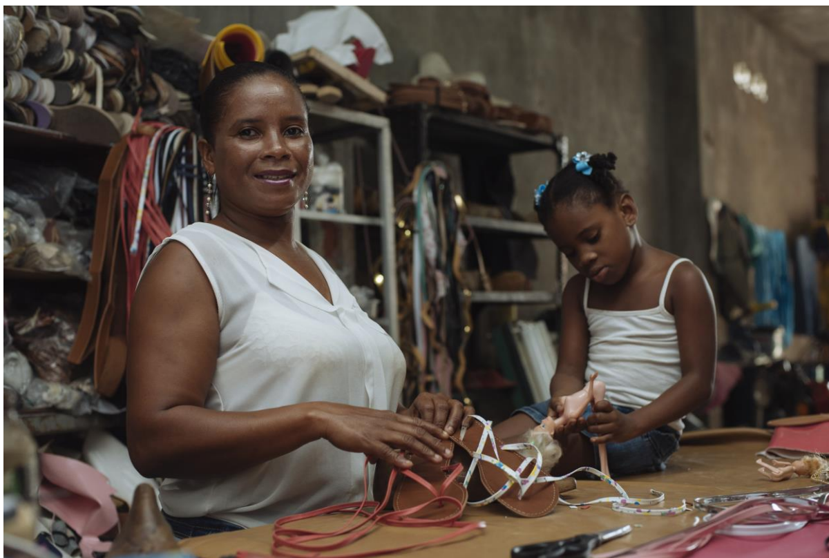
Colombian refugee making sandals in Ecuador.