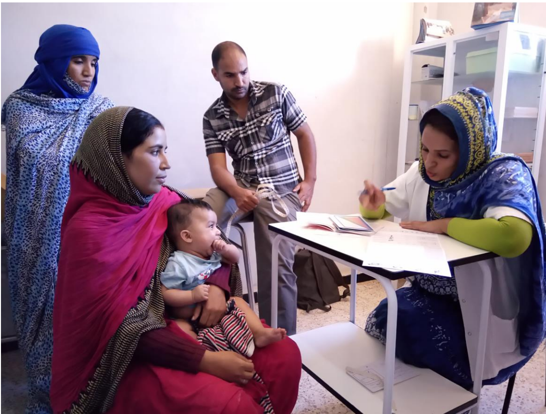
A junior nurse carries out a consultation for an 18-month old infant in Awserd camp.