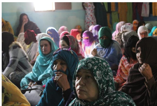
Celebration of International Women's Day in Awserd Camp.