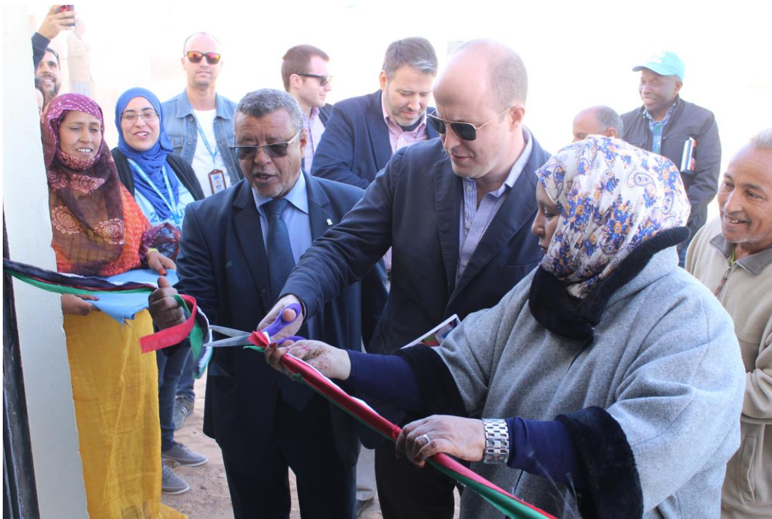
Inauguration of tent sewing workshop.