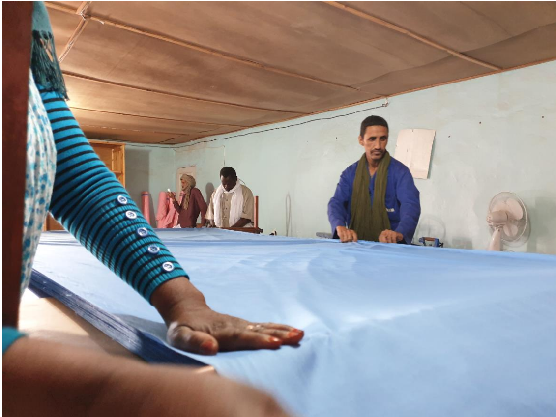
Sahrawi workers in the Boujdour sewing workshop.