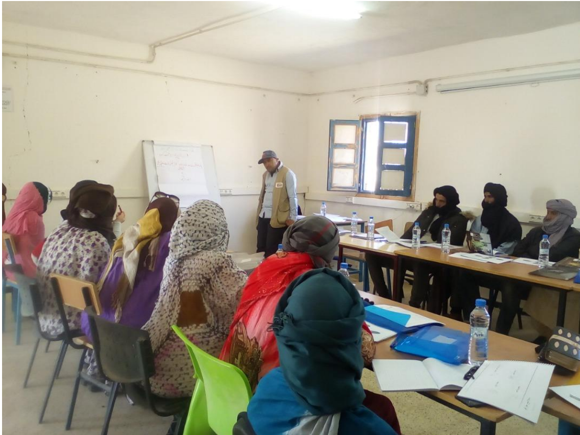
Business management training in Dakhla camp.