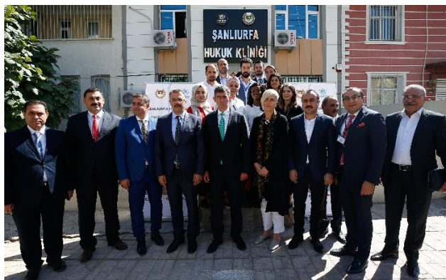
The President of the UTBA and UNHCR Turkey Representative at the opening ceremony of the Legal Clinic in Şanlıurfa

■ In cooperation with the Union of Turkish Bar Associations (UTBA), a Legal Clinic was established in Şanlıurfa. The clinic provided legal assistance to more than 500 cases brought by refugees and asylum-seekers, and counselled even more individuals by sharing information on their rights and obligations in matters of civil law, administrative appeals, and protection of women and children refugees. The clinic also supported the engagement of Bar Associations and lawyers in legal representation.