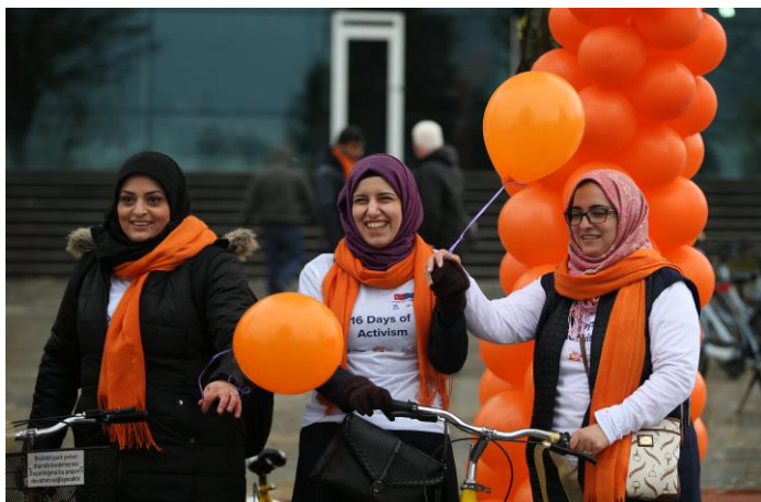
As part of the 16 Days of Activism against Gender-Based Violence Campaign, Gaziantep University and UNHCR organized a bicycle tour in Gaziantep which brought together the city's youth in a colourful event.

■ For the purpose of the prevention, mitigation and response to sexual and gender-based violence (SGBV) through awareness-raising , UNHCR implemented a participatory assessment focused on SGBV, whereby some 30 focus group discussions were conducted with nearly 300 women, men, girls, boys and LGBTI persons of concern. The main protection risks identified were child and forced marriages, sexual harassment in the workplace and domestic violence. The exercise revealed a strong interest for more awareness-raising sessions on the risks, prevention and response to SGBV, on referral mechanisms and national laws. In addition, as part of the 16-days of