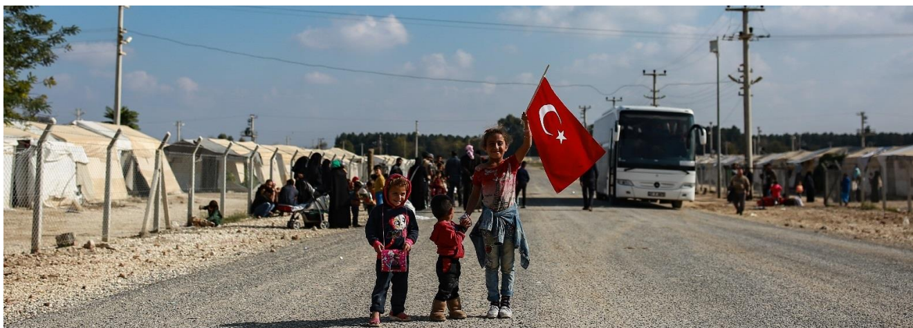
Families leaving Akçakale TAC located in Şanlıurfa to move to urban areas.

■ In 2018, UNHCR supported DGMM in the closure of six temporary accommodation centres (TACs) , which hosted 51,200 persons, and the decongestion of three additional ones , which hosted close to 45,200 persons. Refugees residing in the TACs were given the option of moving to an urban area in a province of their choice, to another TAC identified by DGMM if their TAC was closed, or to stay in their own TAC if it was decongested. UNHCR supported the relocation of refugees who opted to leave their TACs. A one-off cash relocation assistance package to cover transportation, rent and immediate needs was provided and more than 65 million Turkish Liras were received by 60,490 refugees choosing to move to urban areas. Close to 8,685 refugees opting to move to another TAC received transportation assistance.