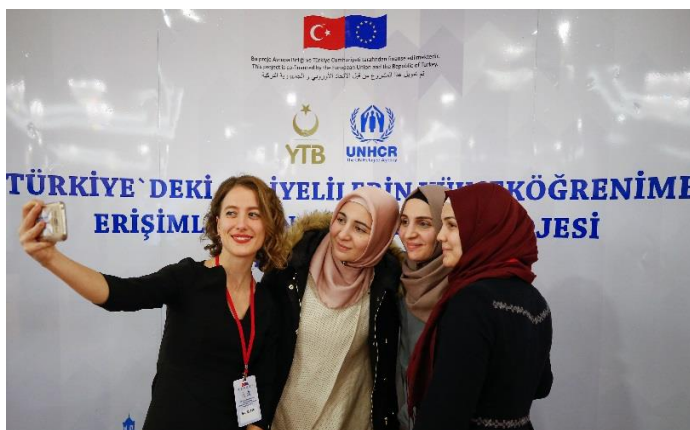
The higher education preparation programme for Syrian students run by UNHCR in collaboration with YTB celebrated the end of the school year with the graduation ceremony in Ankara.

■ Working with the Presidency for Turks Abroad (YTB), UNHCR supported the enrolment of Syrian students in higher education preparation programmes to enable them to meet the language proficiency requirements for admission to higher education. In 2018, over 6,540 students benefitted from the preparation programmes in two cohorts (November 2017-July 2018 and November 2018-July 2019). Close to 80 per cent of the 2017-2018 cohort successfully obtained proficiency certificates that will enable them to enroll in university.