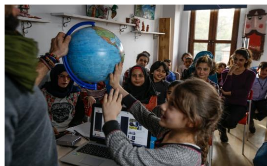
Refugee children learning Turkish at UNHCR's partner office in Istanbul.

■ In 2018, close to 3,000 refugee children and adults were able to attend basic Turkish language class with UNHCR's support, and 143,500 Turkish language teaching textbooks were provided to the Ministry of National Education for refugee education.