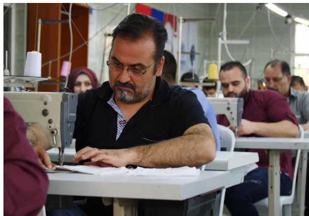
UNHCR provided technical and vocational training for refugees in line with the market needs to increase their employability.

■ In partnership with the Izmir Governorate, the first Textile Machine Operator Training and Harmonization Centre was launched in the Karabağlar district. Close to 85 refugees and host community members took part in vocational training programmes, with a 90 per cent attendance rate and over 50 per cent of participants being women, thanks to the children's day-care specifically designed to encourage women's participation. Turkish language courses were incorporated to facilitate refugees' access to the labour market. More than half of the graduates were referred to textile industry employers, with an estimated employment rate of 20 per cent.