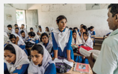
Rohingya refugees attend classes with local Bangladeshi students at Kutupalong High School in Kutupalong village, near Cox’s Bazar, Bangladesh on June 28, 2018. The school has 1,250 students, aged 11 to 17, of whom 70 are Rohingya refugees.