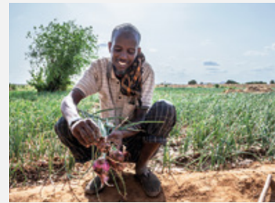
A farmer works land irrigated by a canal in Melkadida, Ethiopia.