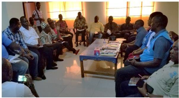
High-level mission to Maryland led by the MIA.