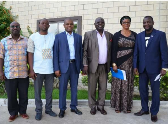
Top L: Participants of the LI Retreat, including Ivorian refugees and members of the host communities from all locations.

Top R : UNHCR OIC, Algassimou Bah; Minister of Internal Affairs, Hon. Varney Sirleaf; Former Minister of Foreign Affairs Mme Marjon Kamara; and Deputy Minister of Justice, Cllr. Nyenanti Tuan.