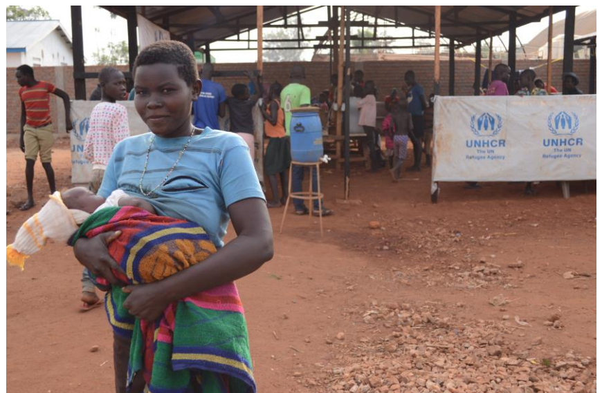
South Sudanese refugees newly arrived in Ituri Province.