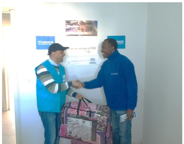
Distribution of non-food items during the winter season