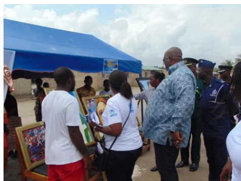
Ghana's Deputy Interior Minister visiting exhibition stands mounted by refugees during World Refugee Day

01 Country Office in Accra 01 Field Office in Takoradi