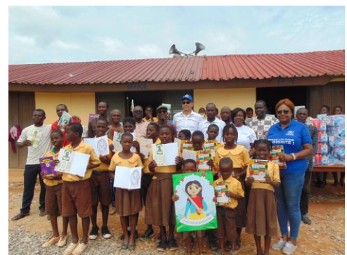
Charge d'Affaires of the Embassy of Peru a.i as they presented branded books to Egyekrom children