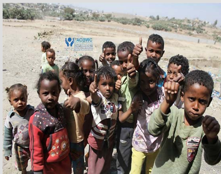
Displaced children playing at hosting site.

Psychosocial support is a strategic activity of the Protection Cluster intended to address the severe, adverse effects on the physical, social, emotional and spiritual well-being of persons due to exposure to conflict, violence, family separation, lack of access to services, and other reasons.