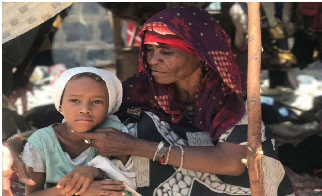
Displaced mother and daughter on the streets of al-Hudaydah city.

Fighting in Yemen escalated dramatically in late-May, when the frontlines in al-Hudaydah began to make rapid advances to the edge of al-Hudaydah City. As documented by OHCHR, the governorates most affected by casualties in the first five months of 2018 were Sa'ada (19%), al-Hudaydah (16%), Taizz (15%) and Sana'a and Amanat al-Asimah (14%). According to the Protection Cluster's Civilian Impact Monitoring Project, a total of 844 incidents of armed violence with civilian impact were recorded in the last six months in monitored governorates, resulting in 1,828