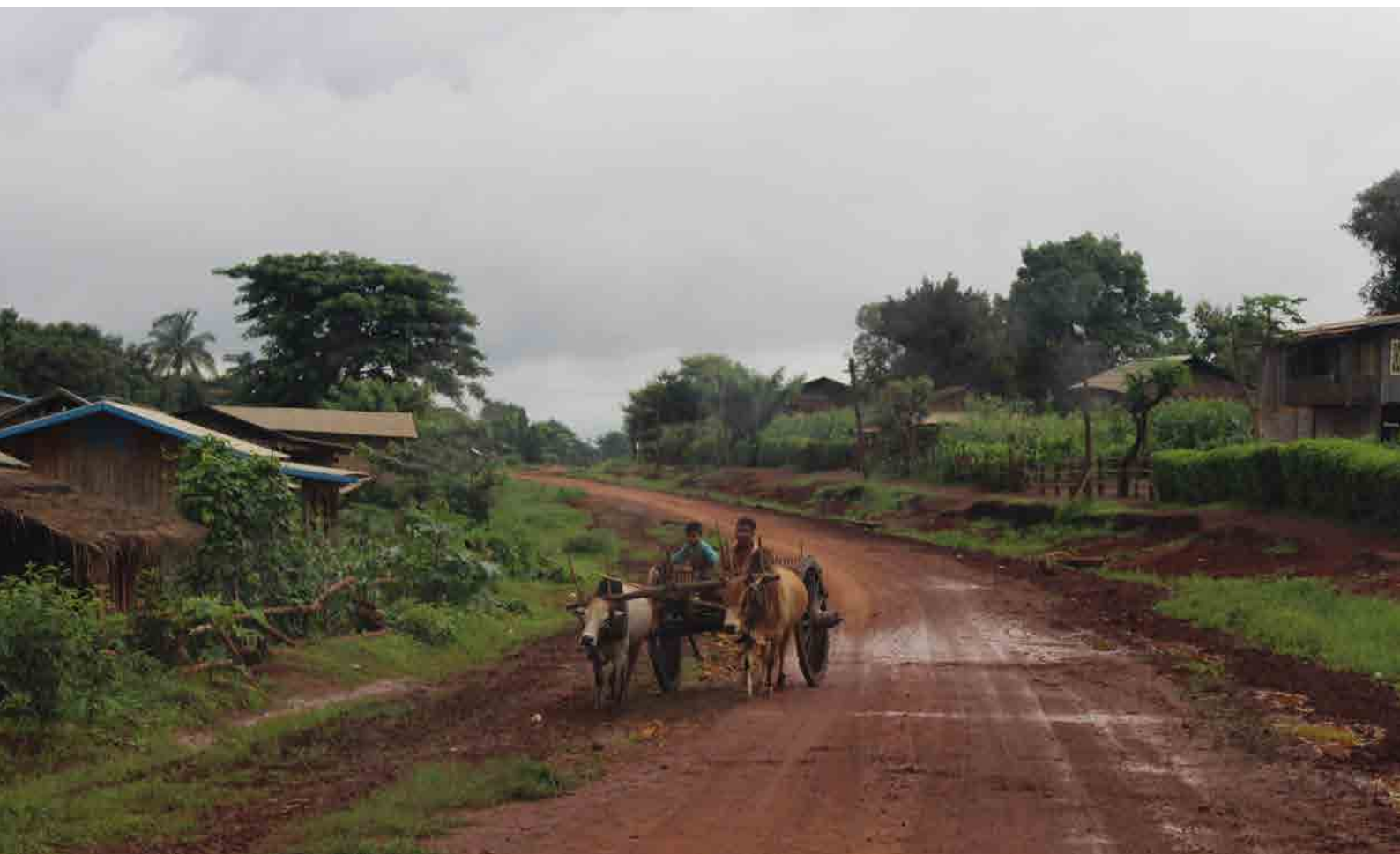
Pho O Kone, Palaw Township, Tanintharyi Region

Particularly crucial in these contexts, of course, are the expressed wishes of those holding restitution rights; beneficiaries of these rights can neither be forced to return, nor forced to accept a resolution of their restitution claims unless this is fully consistent with the law.