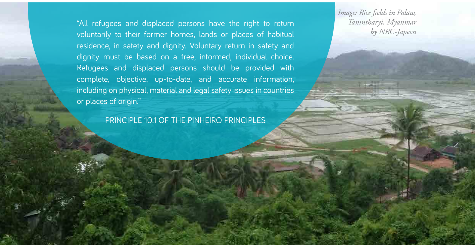
Image: Rice fields in Palaw, Tanintharyi, Myanmar

PRINCIPLE 10.1 OF THE PINHEIRO PRINCIPLES