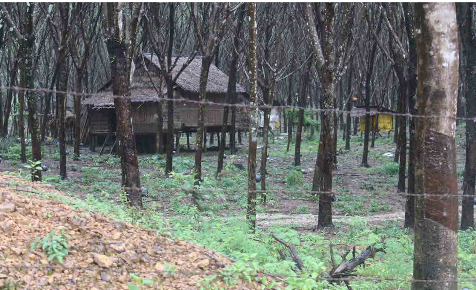
Image: Pa Pyin, Myeik Township, Tanintharyi Region

A: Restitution rights begin to apply the moment you are displaced from your home due to circumstances beyond your control. The concept of restitution, of course, has a lengthy history in terms of international law and, has long been accepted as an important judicial remedy within a wide range of national and international legal codes. It is on these foundations that much of the subsequent progress specifically on housing, land and property restitution has been built. International law approaches restitution generally through the lens of infringements of law due to what are defined as wrongful acts or omissions attributable to States through the application of the law of State responsibility. One of the premier international law making bodies, the International Law Commission, in their 2001 Articles on State Responsibility outlines the legal meaning of the term ‘internationally wrongful acts’, as well as noting the following: Article 34: A State responsible for an internationally wrongful act is under an obligation to make restitution, that is, to re-establish the situation which existed before the wrongful act was committed, provided and to the extent that restitution: (a) is not materially impossible; (b) does not involve a burden out of all proportion to the benefit deriving from restitution instead of compensation.