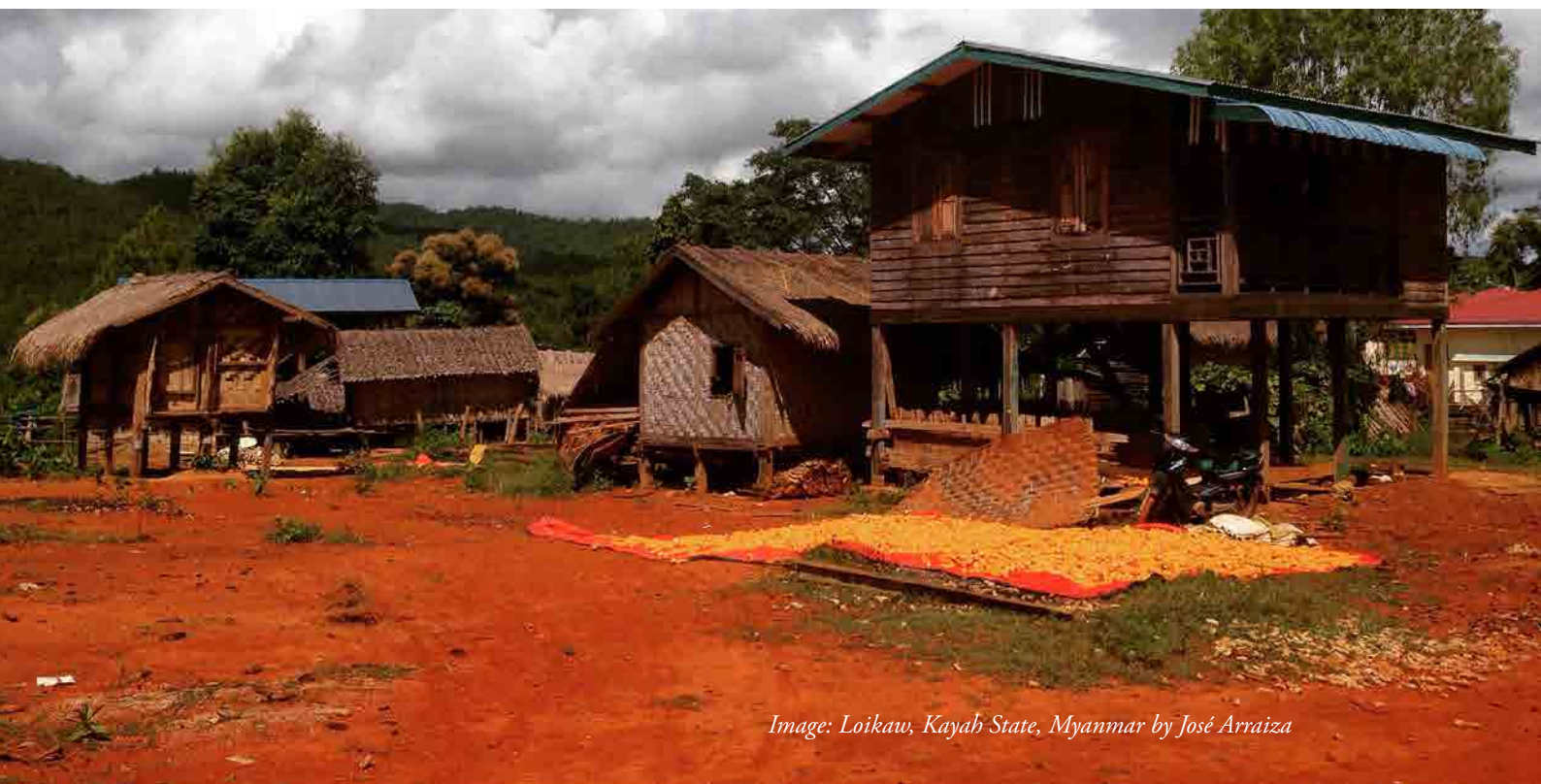
Image: Loikaw, Kayah State, Myanmar