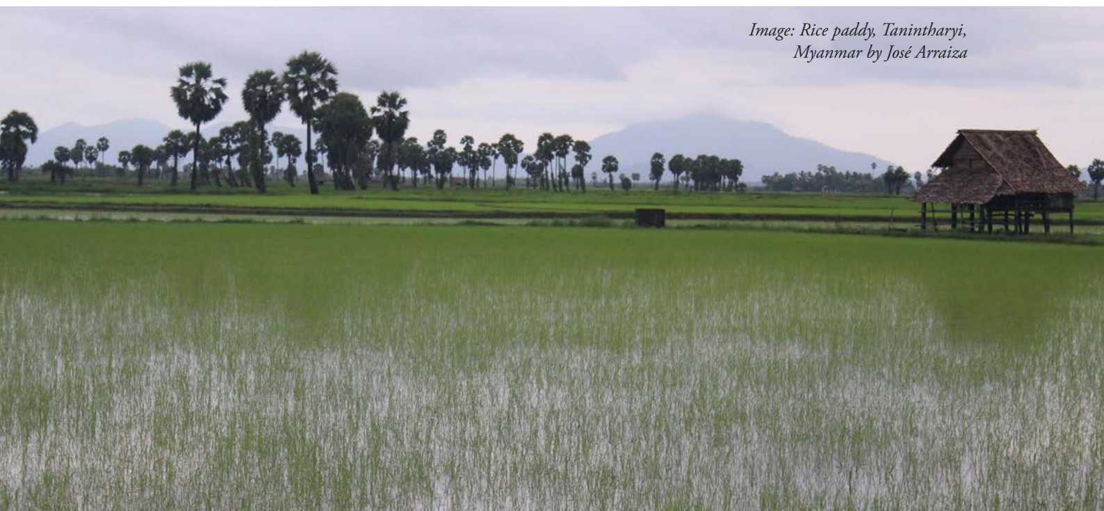
Image: Rice paddy, Tanintharyi, Myanmar

2.2 States shall demonstrably prioritize the right to restitution as the preferred remedy for displacement and as a key element of restorative justice. The right to restitution exists as a distinct right, and is prejudiced neither by the actual return nor non-return of refugees and displaced persons entitled to housing, land and property restitution.