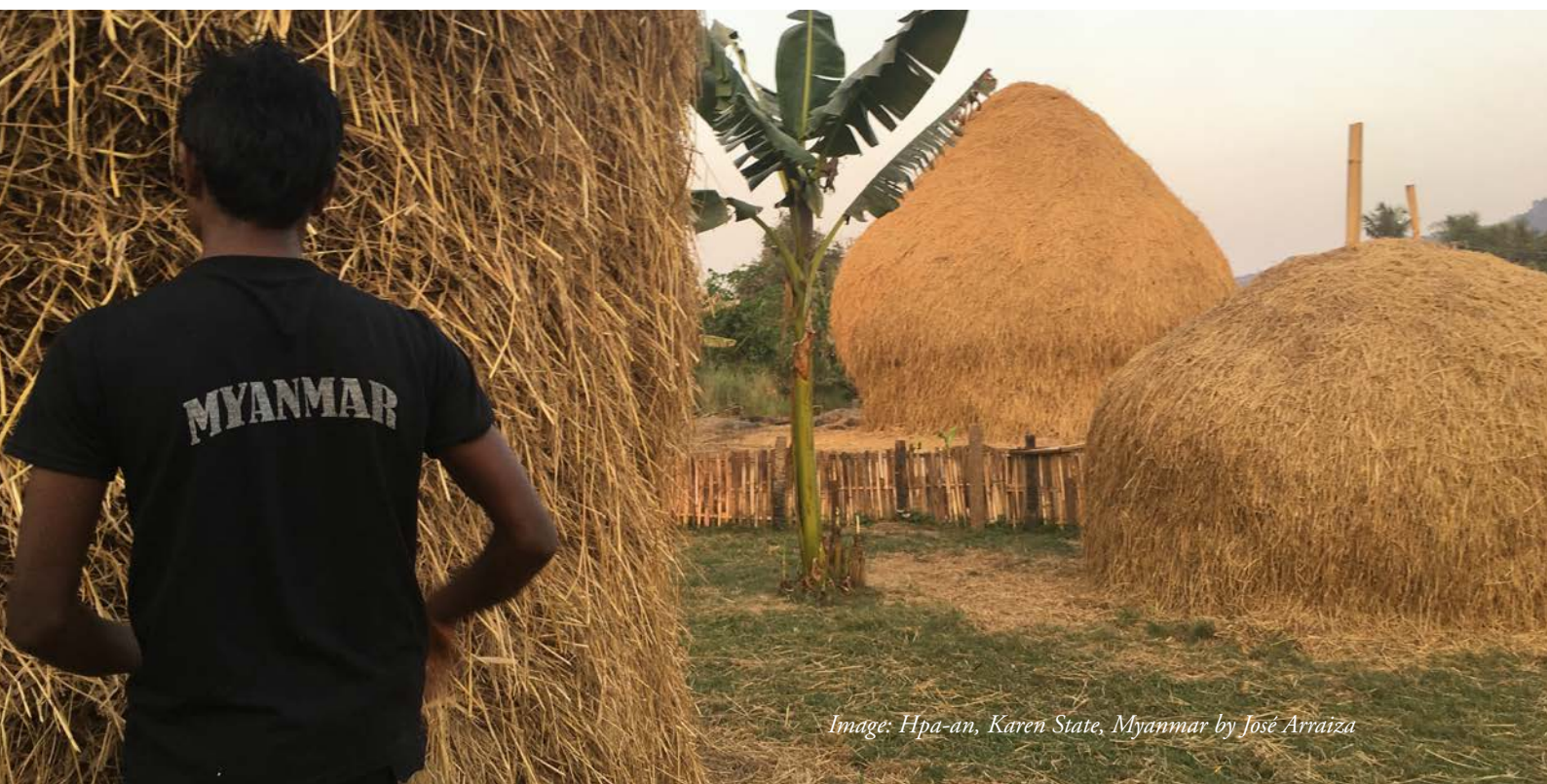
Image: Hpa-an, Karen State, Myanmar

21.2 States should ensure, as a rule, that restitution is only deemed factually impossible in exceptional circumstances, namely when housing, land and/or property is destroyed or when it no longer exists, as determined by an independent, impartial tribunal. Even under such circumstances the holder of the housing, land and/or property right should have the option to repair or rebuild whenever possible. In some situations, a combination of compensation and restitution may be the most appropriate remedy and form of restorative justice.