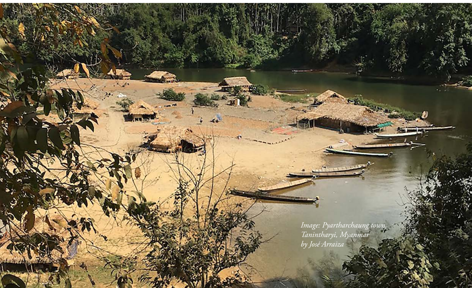
Image: Pyartharchaung town, Tanintharyi, Myanmar

10.4 States should, when necessary, request from other States or international organizations the financial and/or technical assistance required to facilitate the effective voluntary return, in safety and dignity, of refugees and displaced persons.