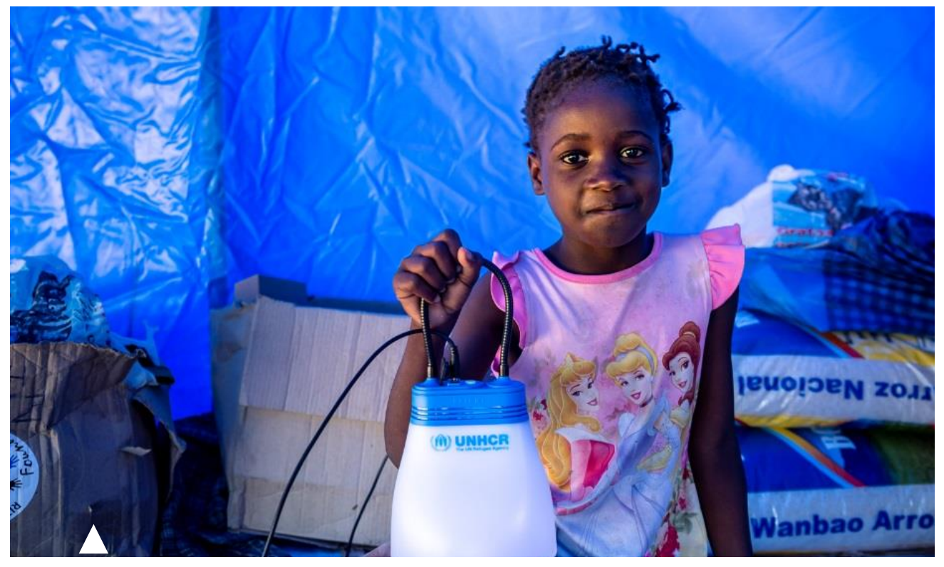
Displaced families take UNHCR solar lanterns back to their tents to charge, in Picoco camp, Beira, Mozambique

On 22 March, the UN Emergency Relief Coordinator activated an "IASC Humanitarian System Wide Scale-Up" in Mozambique for an initial period of three months. UNHCR subsequently activated its internal Level 3 emergency procedures for the Office's response in the three countries, and facilitating the delivery of UNHCR's commitments under the IASC scale-up protocols.