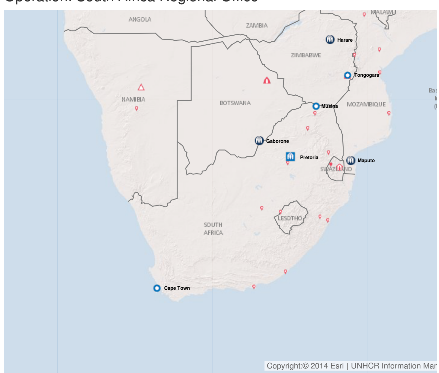
Operation: South Africa Regional Office

Latest update of camps and office locations 21 Nov 2016.