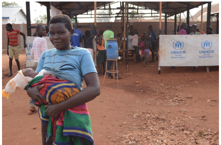
South Sudanese refugees newly arrived in Ituri Province.