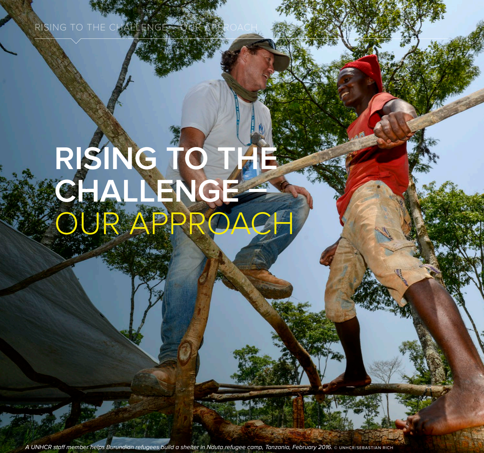
A UNHCR staff member helps Burundian refugees build a shelter in Nduta refugee camp, Tanzania, February 2016.

UNHCR is the world’s leading organization charged with protecting refugees and other forcibly displaced people and with helping to resolve problems of statelessness. In the course of our 65-year history, the massive challenges of forced displacement have led us to move beyond our primary role in protecting and assisting refugees and helping to solve refugee problems, into a broader engagement with people forcibly displaced inside their own countries. Our work extends as well to important areas of prevention and stabilization, including efforts to address the situation of the world’s estimated 10 million stateless people.