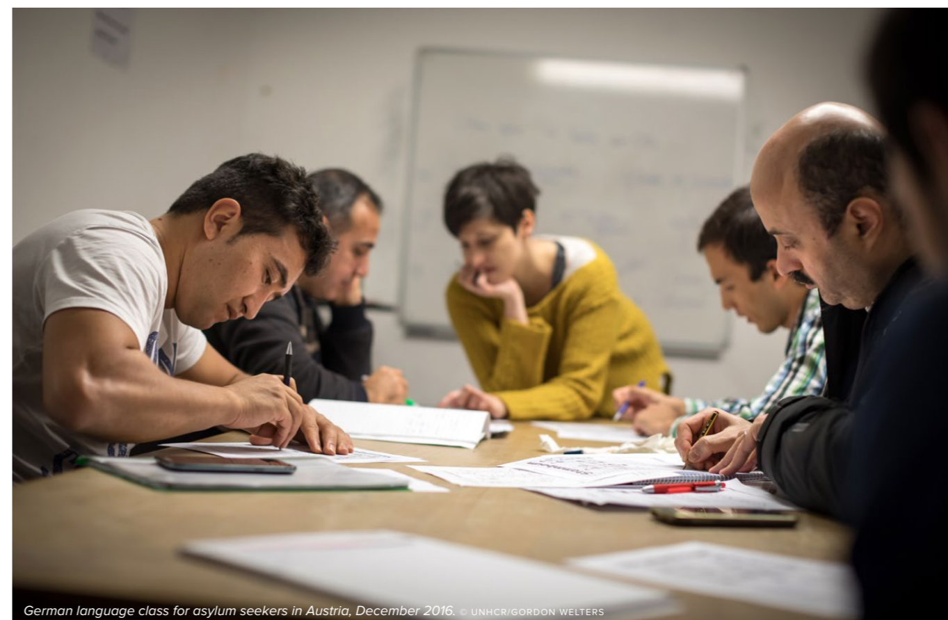
German language class for asylum seekers in Austria, December 2016.

UNHCR has been tasked with further developing this Framework as the basis for the adoption of a Global Compact on Refugees in 2018. This task, and the subsequent implementation of the Global Compact, will be central to our strategic directions in the next few years. A substantive dialogue with and among States and other key partners will be a priority in the effort to achieve the ambitions of the New York Declaration, notably the CRRF, and to steer the follow-up to the Global Compact once adopted.