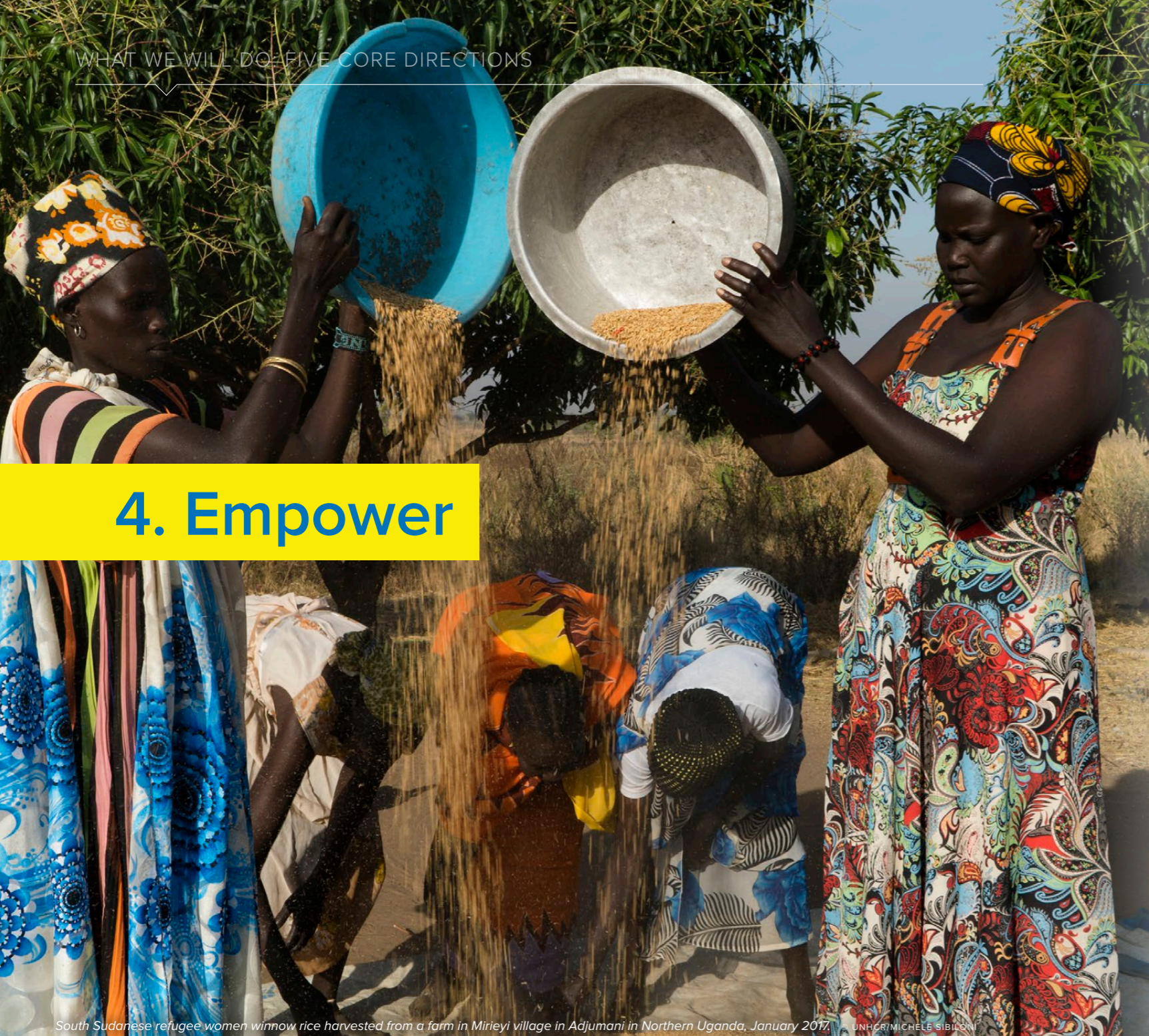
South Sudanese refugee women winnow rice harvested from a farm in Mirieyi village in Adjumani in Northern Uganda, January 2017.

At a time when a larger than ever number of forcibly displaced people are left in a state of dependency, we will take all possible steps to ensure that people of concern can participate in decisions that affect them and thereby gain better control over their own destinies. We will build on the resilience, knowledge and skills of displaced and stateless people, recognizing them as agents with the potential to determine and build their own future and contribute to the development of the communities where they live.