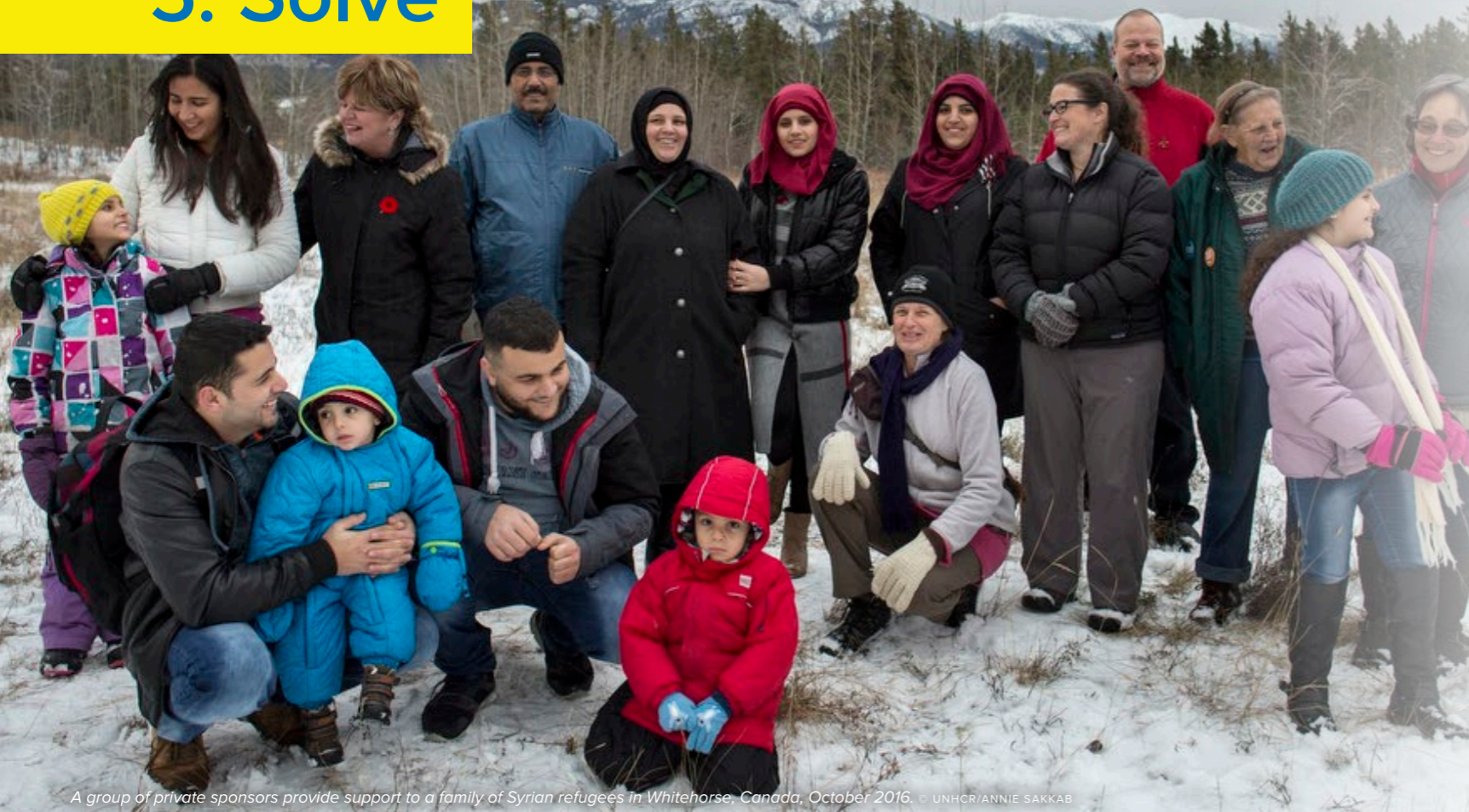
A group of private sponsors provide support to a family of Syrian refugees in Whitehorse, Canada, October 2016.

At a time when so many people are trapped in situations of extended displacement by protracted and recurrent conflict situations, and when others are in danger of being displaced, there is a need to reinforce ongoing efforts to move beyond conventional, short-term responses to crises, which often limit planning for solutions. In line with the New York Declaration, we will sharpen our ‘solutions reflex’ and partner with a broader range of actors - through the development of the CRRF and otherwise - in a drive to expand and diversify solutions opportunities for refugees and internally displaced people, to address the underlying causes of displacement, and to prevent and solve problems of statelessness.