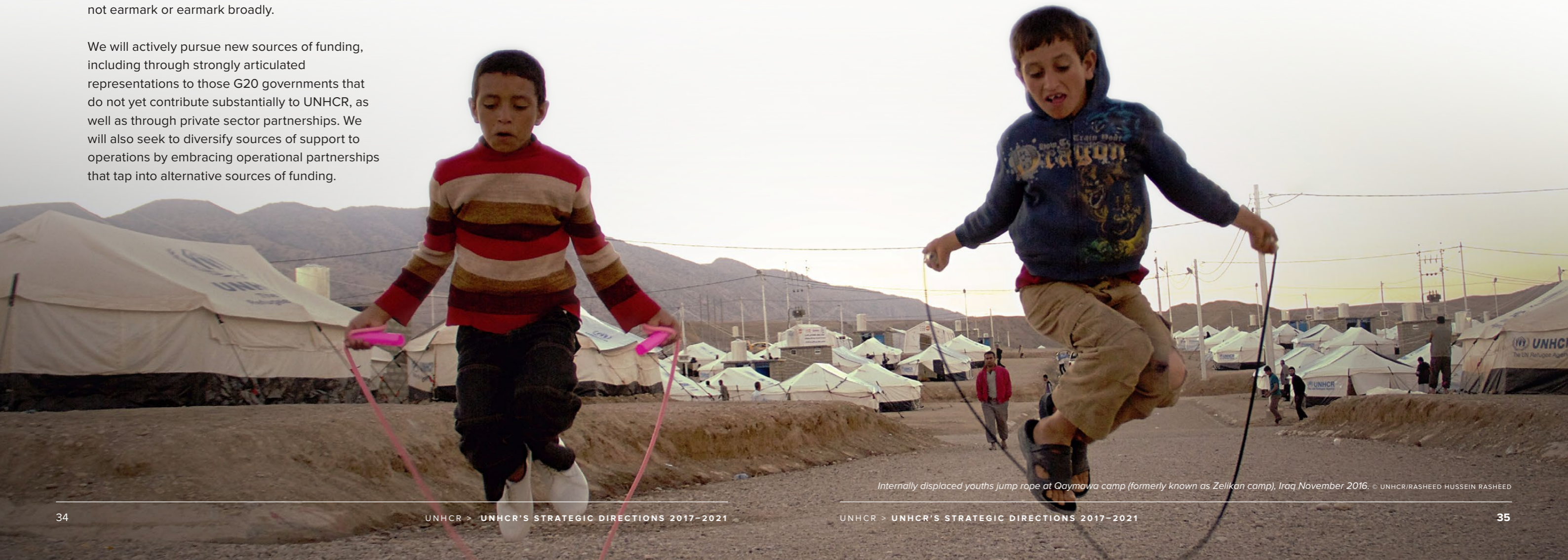
Internally displaced youths jump rope at Qaymawa camp (formerly known as Zelikan camp), Iraq November 2016.

We will ensure that our use of resources is as efficient as possible, recognizing that sound financial management, robust accountability and transparency support a climate of confidence amongst donors and key stakeholders, whose trust is essential as we take these Strategic Directions forward.