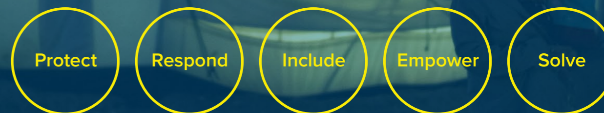
Displaced Iraqis prepare for dinner next to UNHCR tents, a month ahead of winter's arrival, November 2014.