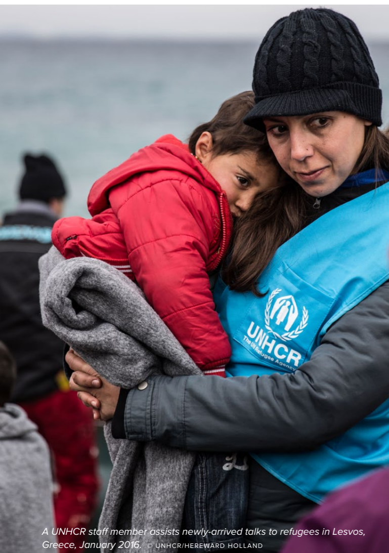
A UNHCR staff member assists newly-arrived talks to refugees in Lesbos, Greece, January 2016.

Current challenges are likely to persist over the next five years and beyond. Instability, conflict and large scale displacement appear set to continue in a number of regions in the absence of effective measures to address underlying causes. At the same time, the dynamic and evolving nature of today's major crises, including shifts in territorial control and the emergence of new actors and drivers of conflict, means that displacement flows are constantly changing, and even where there is no definitive end to conflict, spontaneous returns and possibilities for other solutions may open up in certain locations even as new displacement takes place elsewhere. Progress towards a political settlement in any one of today's major conflicts could have a dramatic impact on the prospects for millions of refugees and internally displaced people. Meanwhile, in many mature economies, economic uncertainty and the perceived negative impact of globalization are likely continue to fuel a nationalistic reflex and a range of social and political concerns that will also influence migration and asylum policies.