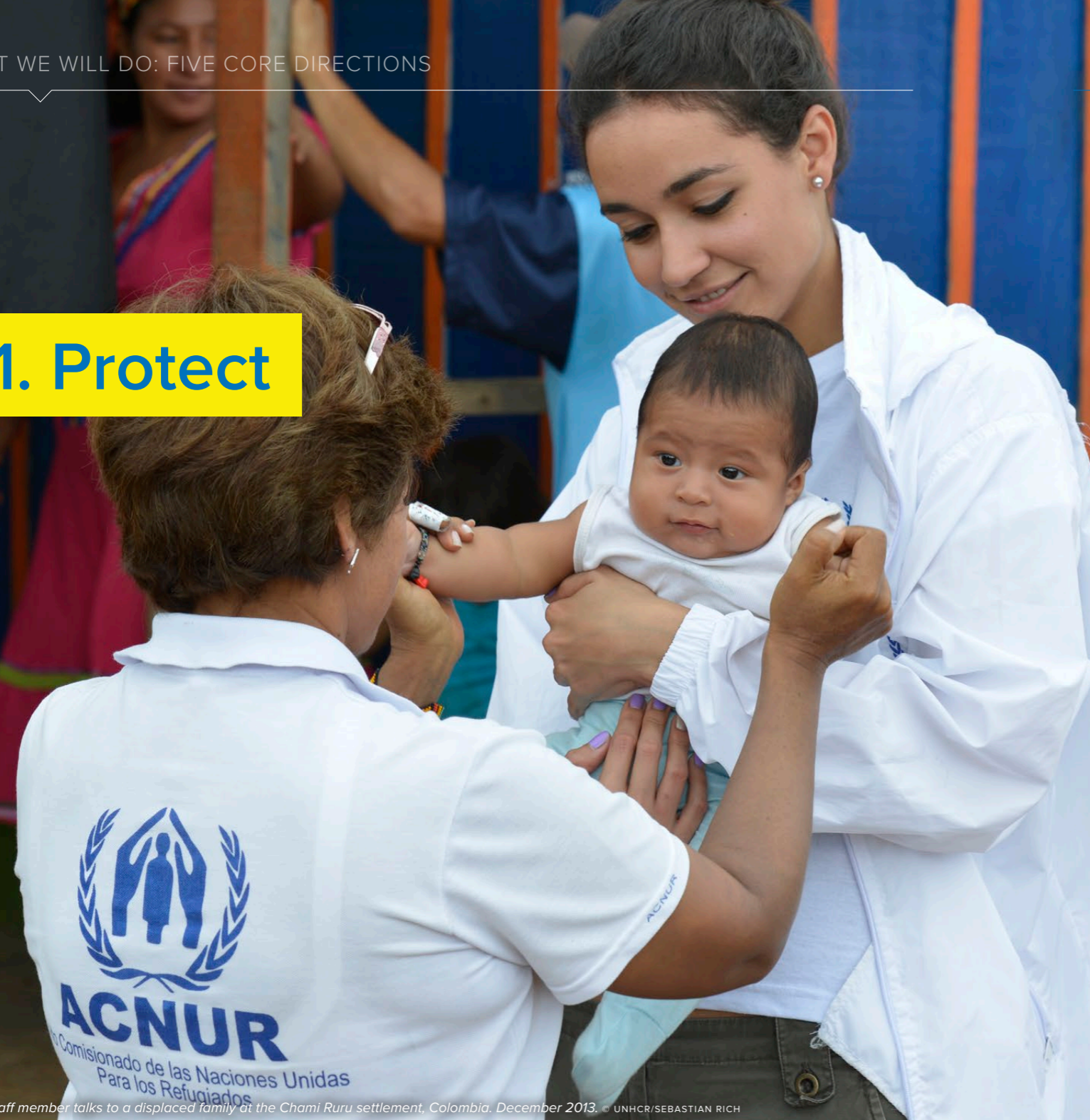
A UNHCR staff member talks to a displaced family at the Chami Ruru settlement, Colombia, December 2013.

At a time when the fundamental principles of protection, asylum and access to safety are being severely tested, we will work to secure and defend the rights of forcibly displaced and stateless people and to ensure that they are protected from harm. Taking a holistic approach that encompasses the entire continuum of forced displacement, we will seek to embed the need for protection and solutions at the centre of our response. In doing this, we will work in strong partnership with the people we serve, as well as with States, helping the latter to develop, both individually and collectively, principled, practical and problem-solving approaches to protection challenges.