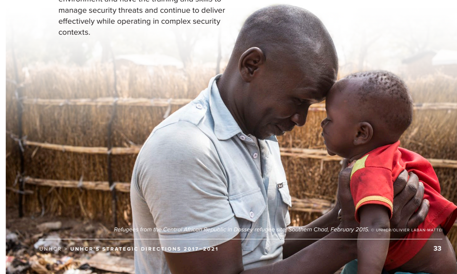
Refugees from the Central African Republic in Dossey refugee site, Southern Chad, February 2015.

Through targeted messages, strategies and campaigns, we will make increased and determined efforts to reach and engage with elements of society that may feel threatened by the presence of asylum-seekers and refugees; we will seek to build empathy, dispel misinformation, and promote understanding and tolerance, leveraging wherever possible the participation and expertise of local partners.