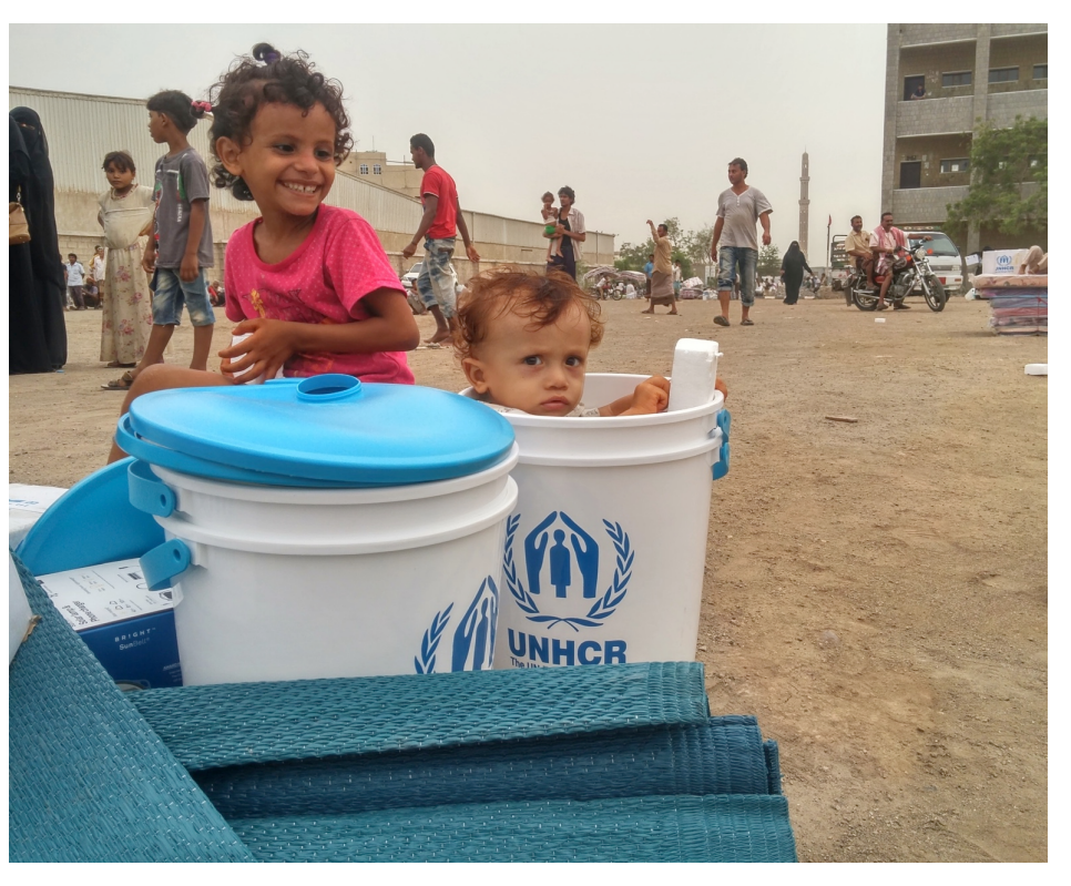
As UNHCR's partner carries out distributions of core relief items in Hudaydah city, two displaced Yemeni children find some enjoyment after being forced to flee their homes.

While displacement of families is ongoing, UNHCR and its partners are working together to reach a verifiable figure of displacement. The protection of civilians is being increasingly threatened in Al Hudaydah by indiscriminate attacks by the warring factions. According to the latest UNHCR-led Protection Cluster Civilian Impact Monitoring Report, almost 50 per cent of civilian casualties in Al Hudaydah to date have occurred when people were in their own homes or farms, and 25 per cent when they were on the road, many of them trying to access services or find routes to safety. The six-month report also highlighted that a total of 844 incidents caused over 1,800 civilian casualties, 26 per cent of which were women and children. Furthermore, 85 per cent of the incidents resulted in psychosocial trauma implications for the people affected. UNHCR continues to remind all parties to the conflict to ensure the protection of civilians and guarantee their access to humanitarian assistance.