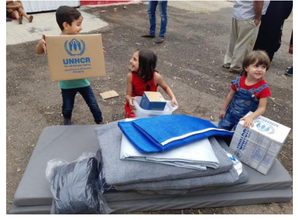
Winter- items distribution in Lattakia and Rural Tartous October 2018