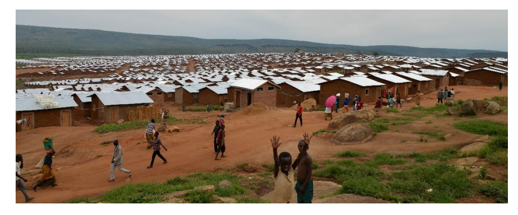
Collaboration between Government of Rwanda and UN Refugee Agency has turned Mahama refugee settlement into a model town two years since opening.

Since being opened by UNHCR and the Government of Rwanda just two years ago (22 April 2015), Mahama is today a model settlement that sets the standard for other camps in the country. Various projects have been developed to improve living conditions inside and around the camp. Mahama continues to grow in order to accommodate new arrivals who are fleeing from Burundi into Rwanda every day. Read More: http://www.unhcr.org/rw/