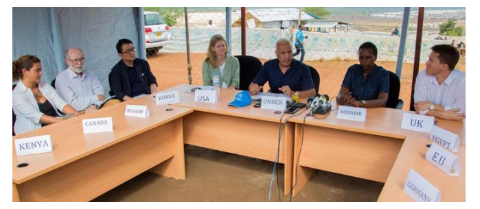
Envoys speaking to the media after visiting Mahama refugee camp.

diplomatic missions in Rwanda joined the UNHCR Representative and Minister of MIDIMAR in a visit to Mugombwa Refugee Camp, which is home to nearly 9,000 Congolese refugees. The visit also followed the UN General Assembly Summit for Refugees and Migrants, which was held on 19 September. Prior to both summits, UNHCR and MIDIMAR organized a joint visit to Mahama camp with over 20 ambassadors and representatives of international organizations in order to meet Burundian refugees and see their living conditions first-hand, and also monitor the facilities and services which are funded by international donors.