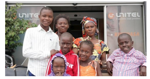
Rwandan refugees return home after a decade in Angola.