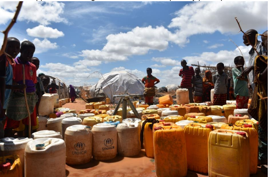
Refugees collect water from one the water distribution points in Dagahaley camp of Dadaab.

entire refugee population in the three Dadaab camps. The water supply schemes convey water to 38 tanks with a total storage capacity of 4,550 m3, distributed through a pipeline network of 233.2 km and relayed to 661 tap stands with about 2,714 taps, scattered around the three camps.