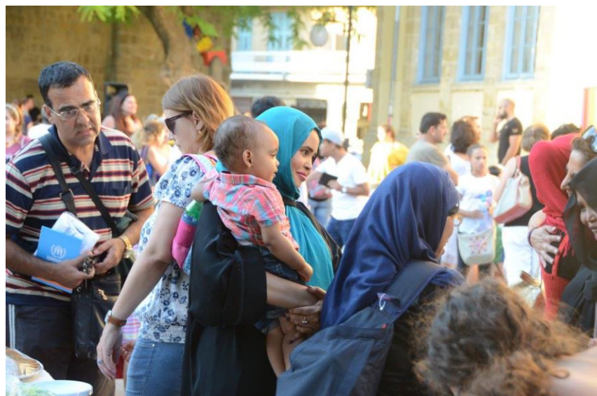
World Refugee Day 2017 Street Festival in Nicosia. Most refugees and asylum-seekers in Cyprus live in urban settings.