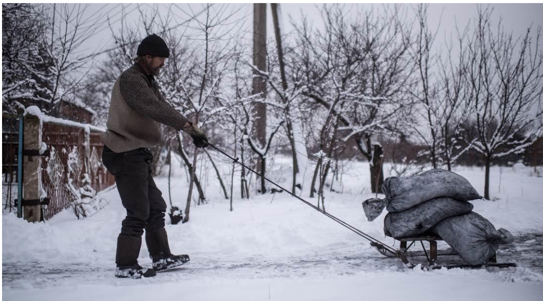
A local resident helps to deliver a supply of coal provided by UNHCR to his elderly neighbour in the village of Luhanske, Donetsk region.