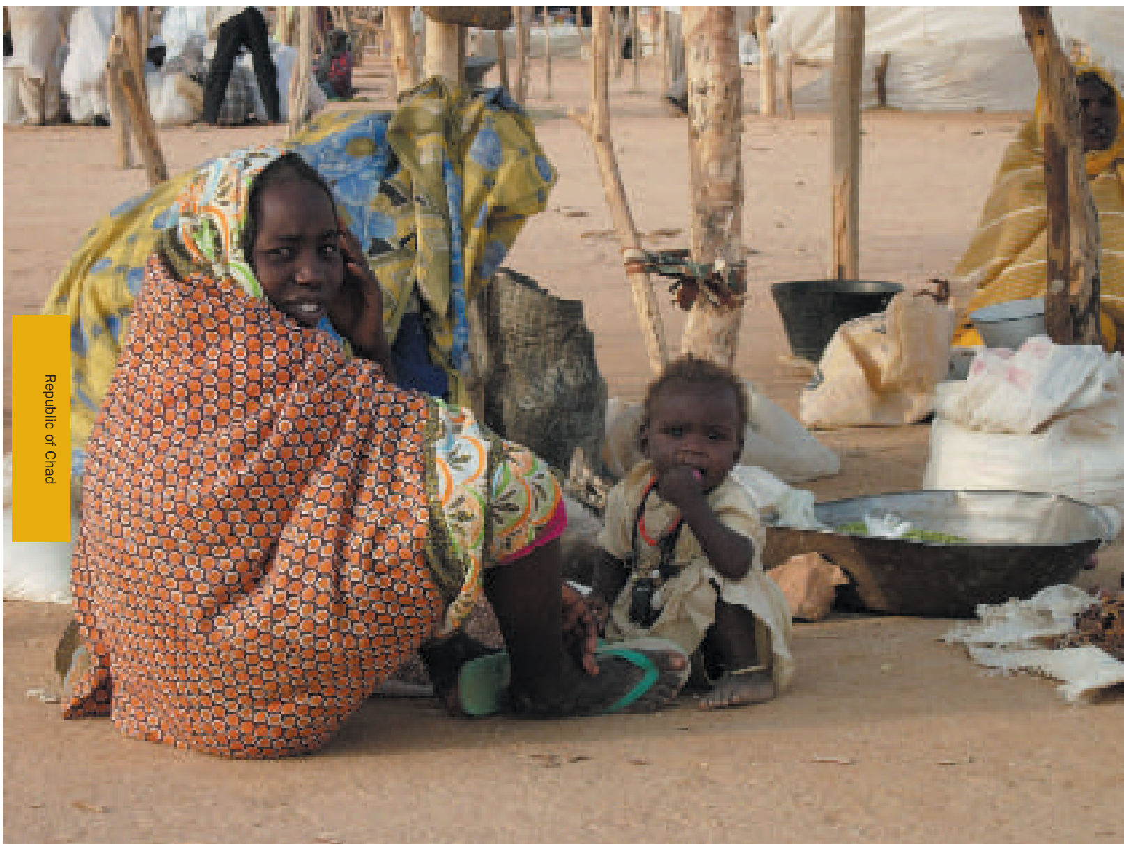
Sudanese refugees from Darfur at the market place in Iridimi camp.