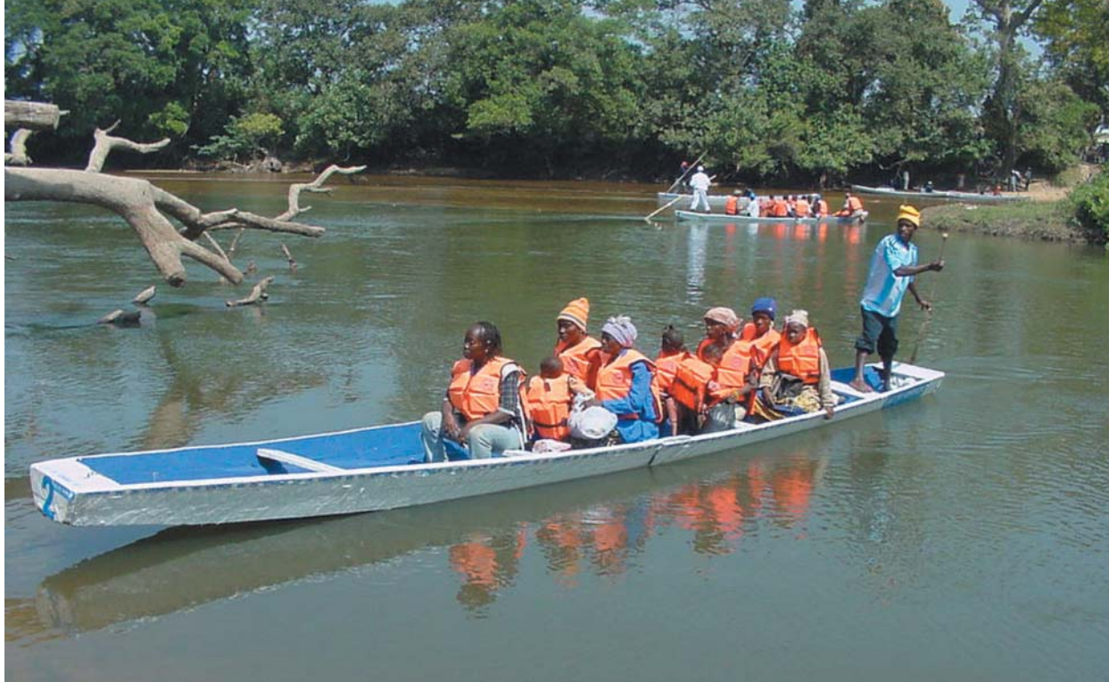
Repatriation of Liberian refugees across the Makona river.