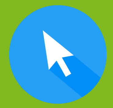
Create your personal fundraising page on fundraise.unhcr.ca

From getting started and setting up your fundraiser, right through to encouraging your family, friends and community to support you.