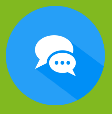
Share your fundraiser with your supporters via email, social media, etc.