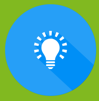
The system will walk you through setting up your fundraising profile