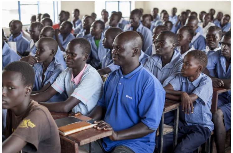
PHOTO: Adult learner attends class over-populated classroom at Kalobeyei settlement