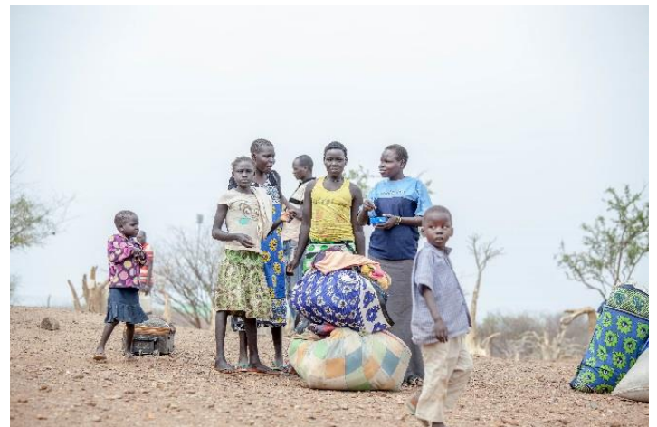
South Sudanese refugees arrive at Nadapal Transit Centre