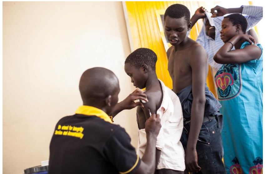
New arrival South Sudanese family receive yellow fever vaccine at Nadapal Transit Centre