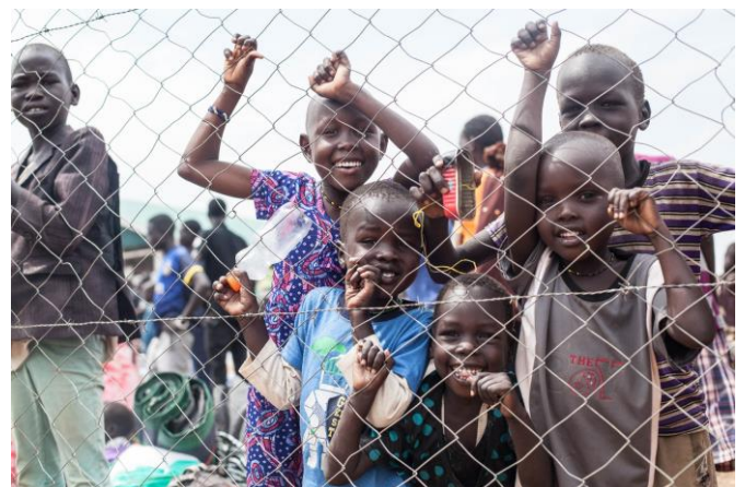
PHOTO: New arrival children at Nadapal Transit Centre