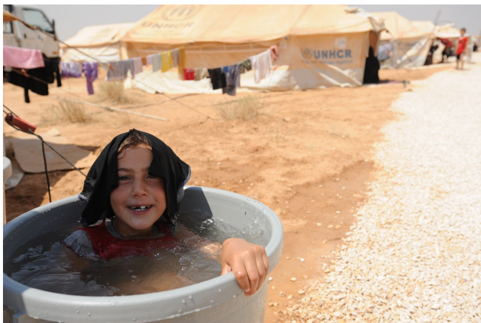
Za'atari camp, Jordan.