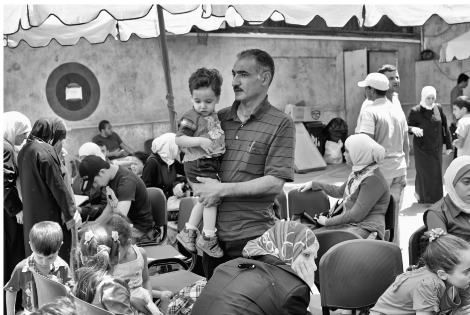
Syrian refugees registering for protection and other social services at UNHCR offices in the Zamalek neighbourhood in Cairo.