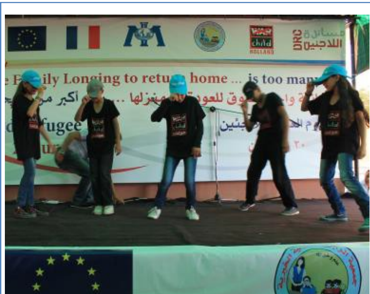
UNHCR, Danish Refugee Council, Save the Children and other partners hosted a series of activities at the Halba community centre in Akkar. Events brought together local and regional authorities, and children from the Wadi Khaled tented settlement.

The regional response for refugees fleeing Syria is the coordinated effort of 126 participating organizations, including 84 appealing: