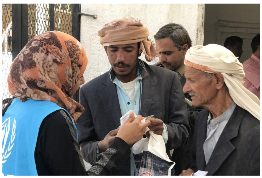
The numbers of IDPs and refugees approaching UNHCR-supported community centres in need of assistance doubled this week.

At least 375 refugees, who were hoping to return home to Somalia, supported by UNHCR and IOM through an Assisted Spontaneous Return programme, remain in Yemen, as three boat departures from the Port of Aden to Berbera in Somalia were postponed due to the closure of Yemen's sea ports. Furthermore, border closures are also impacting aid deliveries. New stocks of UNHCR emergency assistance destined for close to 140,000 IDPs have been halted. Together with the humanitarian community in Yemen, UNHCR is advocating for the border closures to be lifted without delay, as closures are posing a critical threat to the millions already struggling to survive.